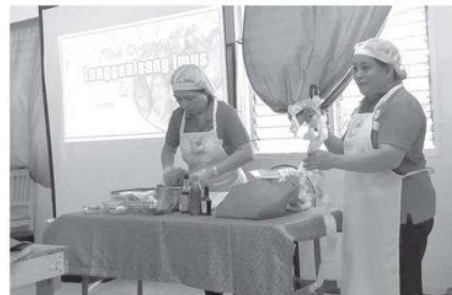
Tanzang Luma ES teachers share their knowledge on how to cook Original Longganisang Imus and make it extra special with homemade Malunggay powder.