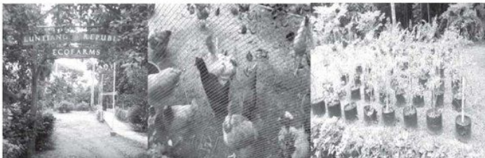
Photo shown The Luntiung Republika Ecofarms entrance, the native chickens in their poultry and the chili plants in the bags.