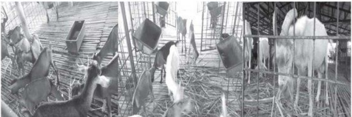
Different breedings of goats in Graco Farm, photo shown the goats den.