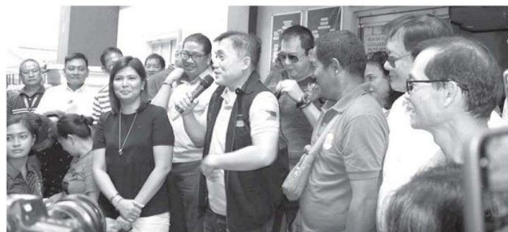
Photo Show Sen. Bong Go, City Mayor Lani M. Revilla and City Government Officials.

Other bills are amendments to the National Housing Development Production and Financing Act; the enactment of the Fire Protection Modernization Act of 2019; and a bill postponing the barangay elections to October 2022 from May 2020. (DOMZ B. CAOILE)