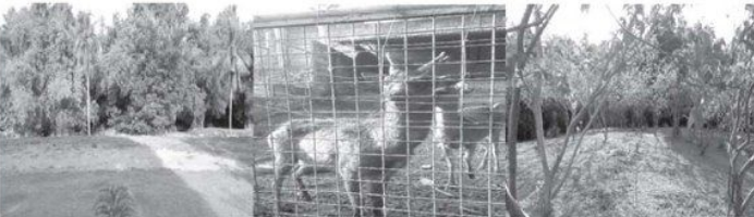
Another A.T.I. learning sites located in Maragondon, Cavite, the Terra Verde Ecofarm focuses on livestock and in fruits and vegetable plantation.