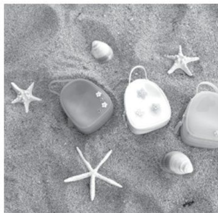
Blushing jelly bags for summer statement.

This fun kid's summer accessories must have are available at SM Accessories Kids department of The SM Store.