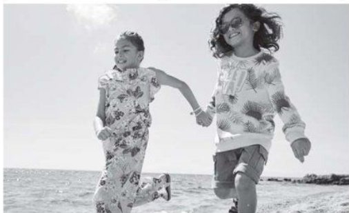
Summer is a fun time to accessories with SM Accessories Kids.

THE heat is still on. And if you've still got time for that family vacay, SM Accessories will help make your kids sunshine ready with its collection of hats, sun glasses, watches and small bags.