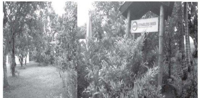
Ato Belen's farm different plantation views and their greenhouse