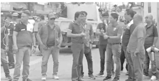
MAYOR EMMANUEL L. MALIKSI in action: Photos show the mayor together with the city government officials in the clearing of road obstructions and cleaning operations in Barangay Bucandala Wednesday August 23.

Mayor Emmanuel L. Maliksi Sarno, personnel from the City personally led the clearing teams and Tourism Office, barangay together with City Engr. Cris and city officials.