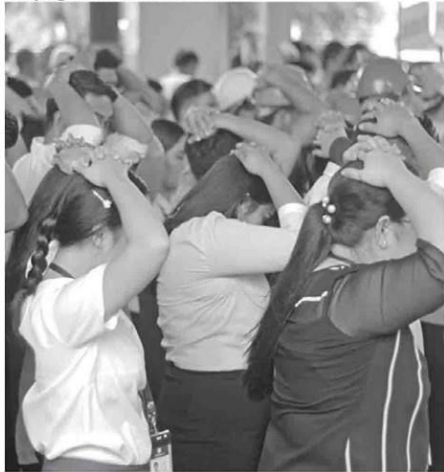
EMPLOYEES, tenants and shoppers of SM City Bacoor still covering their heads while lining up at the designated mall evacuation site.

SM CITY BACOOR, CAVITE | August 8, 2019 - Supervised by the Bacoor Disaster Risk Reduction and Management Office, SM City Bacoor participated at the 3rd Quarter National Simultaneous Drill (NSEED) last August 8, 2019 within its mall premises to raise awareness on disaster preparedness, and to ensure the safety of all its shoppers, tenants and employees shall a real earthquake occurs. The Earthquake Drill with participants started from 2:00PM and lasted for about 8 minutes after the initial standard Operating Procedure (duck, cover and hold) up to the evacuation and tallying of official headcount.