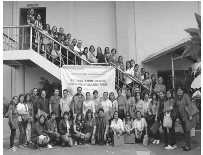
CALABARZON staff and Barangay Health Workers participants during the first day of the "UHC Orientation for BHW of Cavite Province" held in Tanza, Cavite from August 22-23, 2019

Publication: Cavite Times Journal Dates: August 6, 13 & 20, 2019