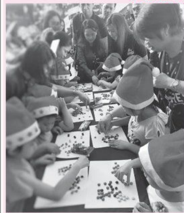
Kids from City Homes Daycare Center playing color game with SM City Molino's Volunteers