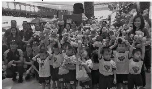
Children from Panapan 5, Day Care Center, Bacoor City with their new cuddly friends SM Bears of Joy, and the volunteers from SM City Bacoor