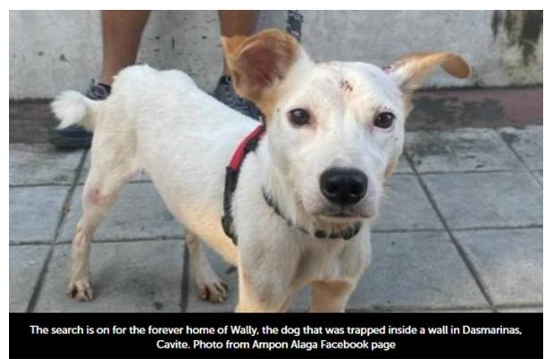
The search is on for the forever home of Wally, the dog that was trapped inside a wall in Dasmariñas, Cavite.