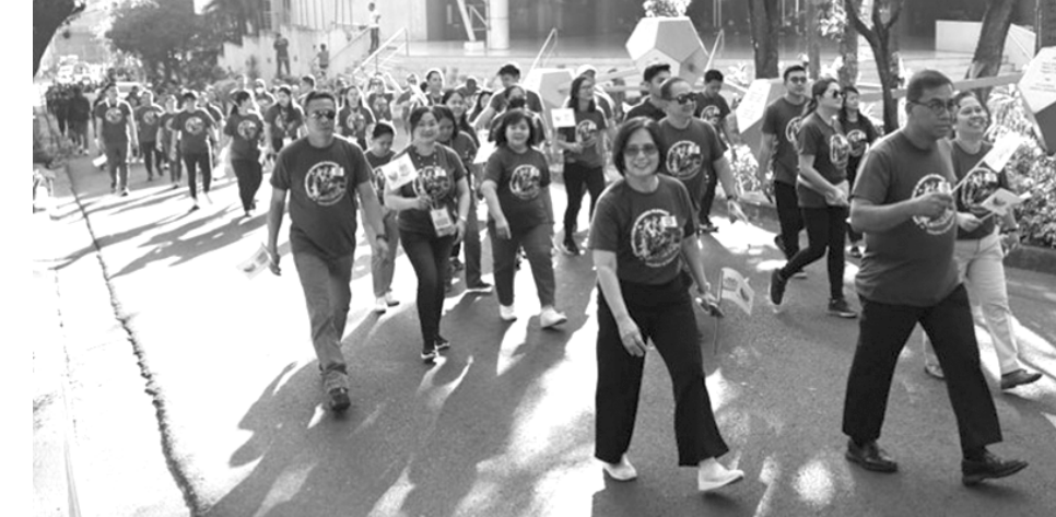
DOST-wide parade for 2024 National Women's Month Celebration led by DOST Sec. Solidum and DOST ASec. Ignacio.

Paving appreciation and recognition for women's role Meanwhile, the DOST