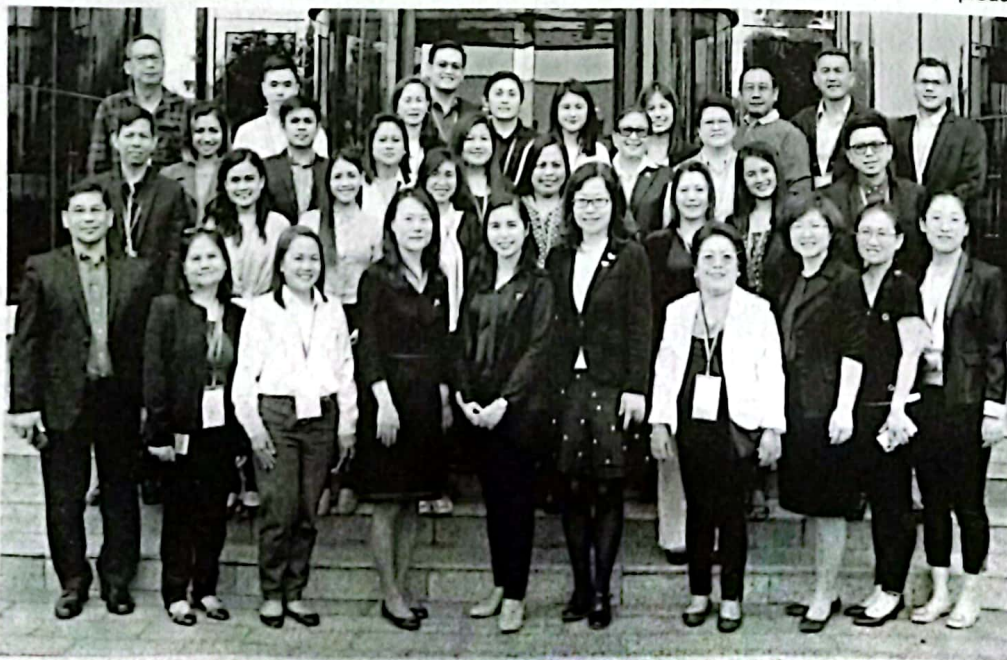
ABOUT 30 government and private media practitioners and information officers currently undergo broadcast training in China.