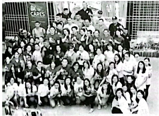
Volunteered employees together with the teachers and staff of Likha Elementary School in Bacoor, posed for a souvenir photo during the Brigada Eskwela 2019.