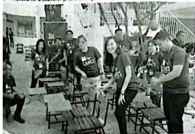
Employees of SM Bacoor posed for a souvenir photo during the Brigada Eskwela 2019. The employees volunteerism program is a Human Resource program that promotes volunteerism among SM employees. It aims to encourage employees to serve the community and make a difference in their own small way.

Republic of the Philippines Fourth Judicial Region Regional Trial Court of Cavite Office of the Clerk of Court & Ex-Officio Sheriff New Justice Hall, J.P. Rizal Avenue, Kaybagal South, Tagaytay City