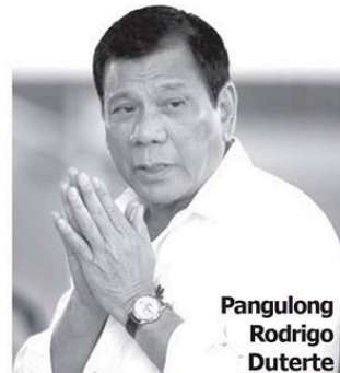
Pangulong Rodrigo Duterte

Complaints Center noong 2016 sa bisa ng Executive Order No. 6 ng Pangulo upang tumanggap ng mga reklamo at hinaing ng mga mamamayan sa mga opisyal at serbisyo ng pamahalaan.