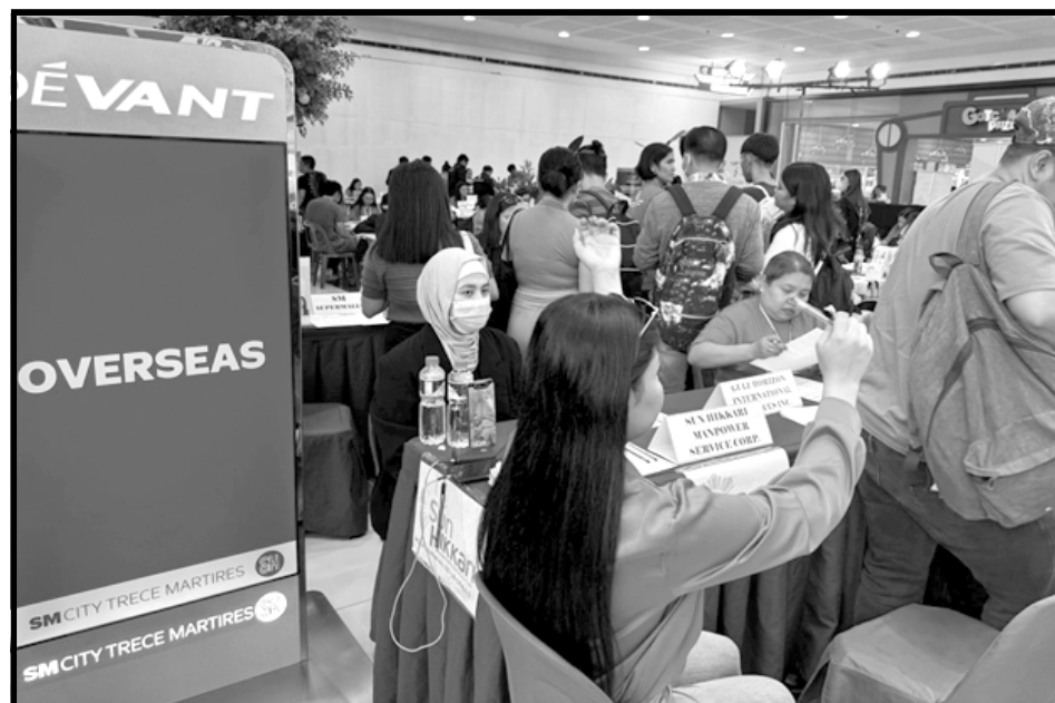
Job fair at SM City Trece Martires- City government of Trece Martires headed by the Public Employment Services Office, conducted a mega job fair which gather 90 companies consisting of local, overseas and government at SM City Trece Martires on May 22, 2024.

For inquiries about this press release, please contact corpcomm@mptsouth.com or message us at https://www.facebook.com/biyahengsouth