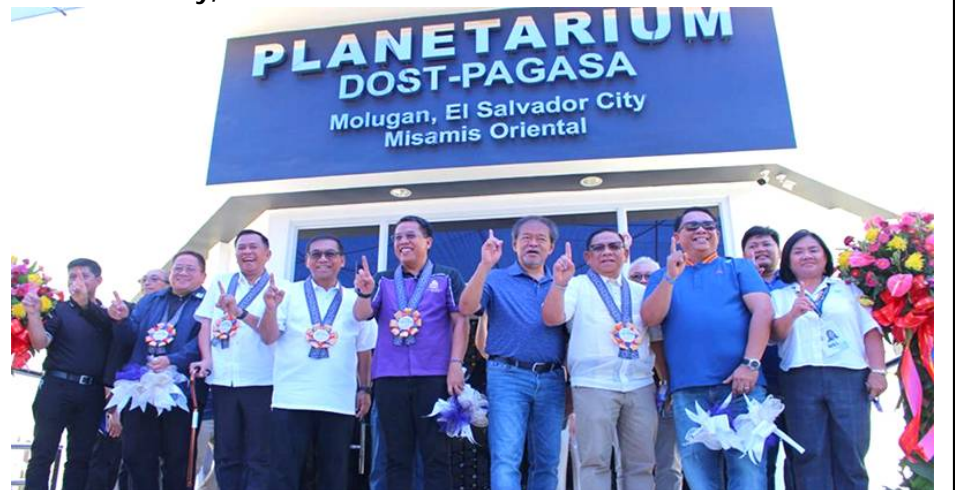
Group Photo of dignitaries during the launching of Mindanao's first Planetarium

Mindanao PAGASA Regional Services Division (MPRSD) inaugurated Mindanao's first Planetarium on May 17, 2024, at MPRSD at DOST PAGASA, El Salvador City, Misamis Oriental.