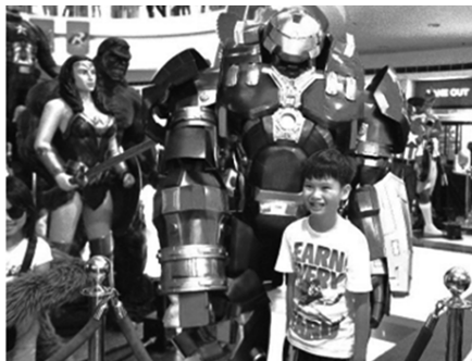
Beaming with joy, a young fan poses with larger-than-life superheroes.