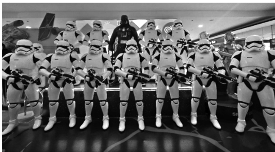
Classic icons from movie hits from Drew's Lifesize Statues are showcased at the exhibit.