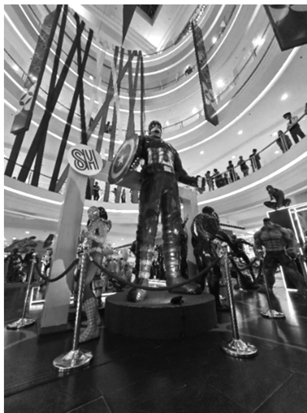
Along with the iconic characters and anime classics stood this 14ft Superhero figure which steals the scene and captures the attention of the shoppers. This gigantic action figure will be exclusively displayed at SM City Bacoor's Event Center from June 8 to 22 only.