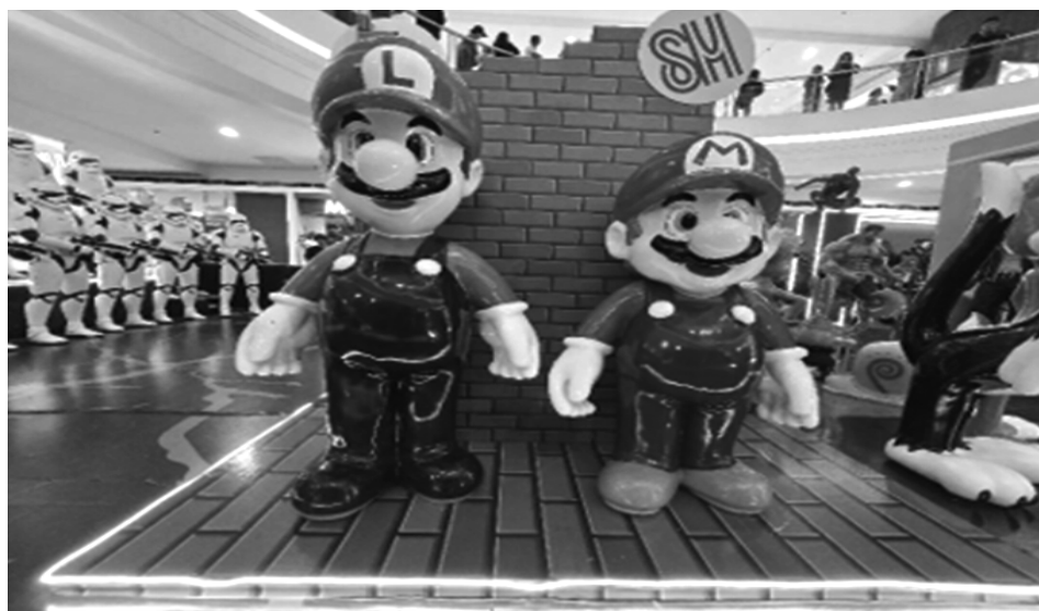
Pixelated no more, these iconic brothers stand ready for shoppers of all ages visiting the exhibit.