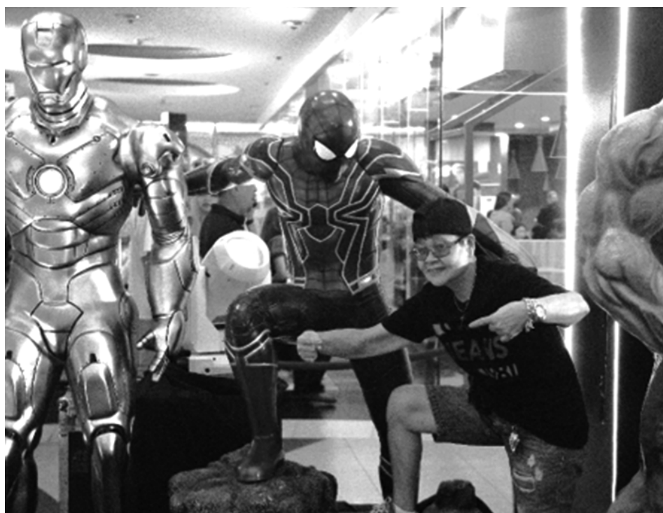
Embracing the superhero spirit, this senior shopper enjoys the thrill brought by his favorite character at the exhibit.