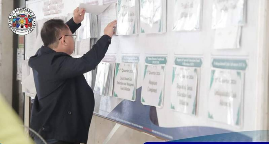
TAPAT SA BAYAN. TAPAT SA USAPAN. 2024 SGLG REGIONAL VALIDATION JUNE 11, 2024 / PROVINCIAL CAPITOL, TRECE MARTIRES CITY

Governor Jonvic Remulla led the PGC team as it showcased commitment to good governance and the unrelenting pursuit of excellence in public service.