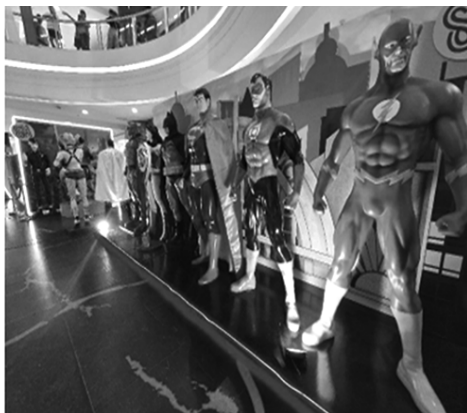
Zapping with superpowers, these comic heroes line up for a perfect photo snap.