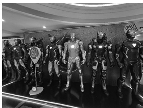
A stunning display of superhero suits are exclusively displayed at the Toy Fezt 2.0. This collection will be travelling at SM Malls in South Luzon until 2025.