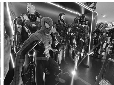
Saving the spot are these life-size superheroes ready for a photo snap.