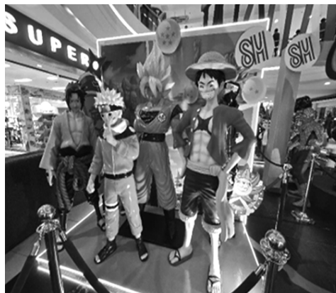
These anime classics from your favorite Japanese cartoons are also showcased at the exhibit.

toyverse of collectibles displayed at SM City Sorsogon. This exhibit will continue to travel from SM City Bacoor to all SM malls in South Luzon until 2025. Next stop is SM City Sta. Rosa, so watch out! Don't miss out on this unique opportunity to immerse yourself in the world of action figures and collectibles. Be part of the excitement and celebrate your favorite characters at Toy Fezt 2.0!