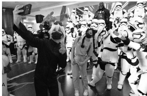
Fans immerse themselves in the excitement as they pose iconic movie characters.

Excitement reached a fever pitch as toy collectors gathered at SM City Bacoor for the highly anticipated launch of Toy Fezt 2.0. From June 8 to 22, the mall's Event Center transformed into a spectacular showcase from two esteemed artists famous for their fan-made, life-sized, and larger-than-life action figures, offering shoppers an exclusive and exhilarating experience.