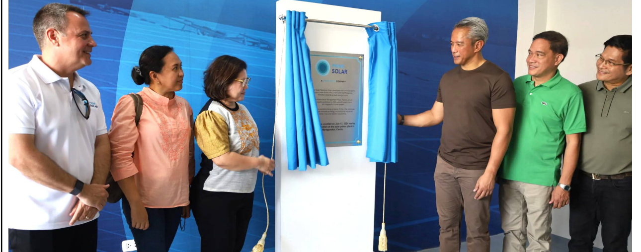
MARKER. Officials and company officers unveil the marker of the completed Maragondon solar power plant in Maragondon, Cavite.