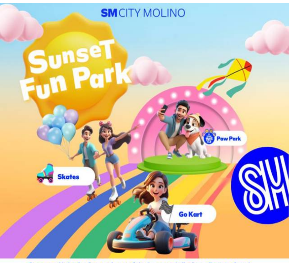
Come and join the fun at the roof deck, open daily from 5pm to 9pm!

The Philippine Rural Reconstruction Movement (PRRM) is a Non-Governmental Organization committed to improving the lives of rural communities through sustainable development programs. PRRM is actively involved in projects that address environmental sustainability, livelihood improvement, and social development.