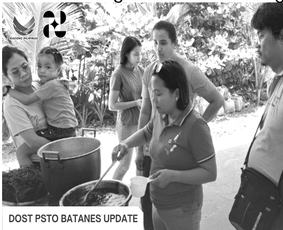
DOST PSTO BATANES UPDATE

The training on Ready-To-Drink (RTD) Tubho Tea is one of the initiatives of DOST PSTO Batanes as part of the Nutrition Month Celebration, which aligns with broader efforts to promote healthy living. Tubho tea is known for its health benefits, and offering it in a ready-to-drink format makes it more accessible to consumers who are seeking convenient yet nutritious beverage options.