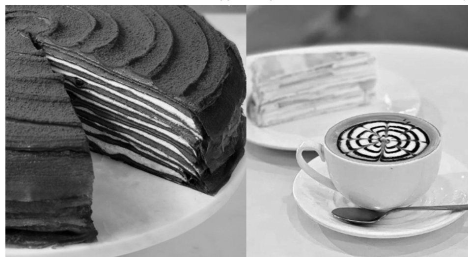
Paper Moon's signature mille crepe is best paired with a hot cup of coffee.

For a full meal, Crustasia Asian Seafood Market is a must-try. They serve the freshest seafood, prepared in delicious ways with recipes from Thailand, Malaysia, Indonesia, and Singapore. It's a true Southeast Asian feast that will satisfy any seafood lover—and will definitely