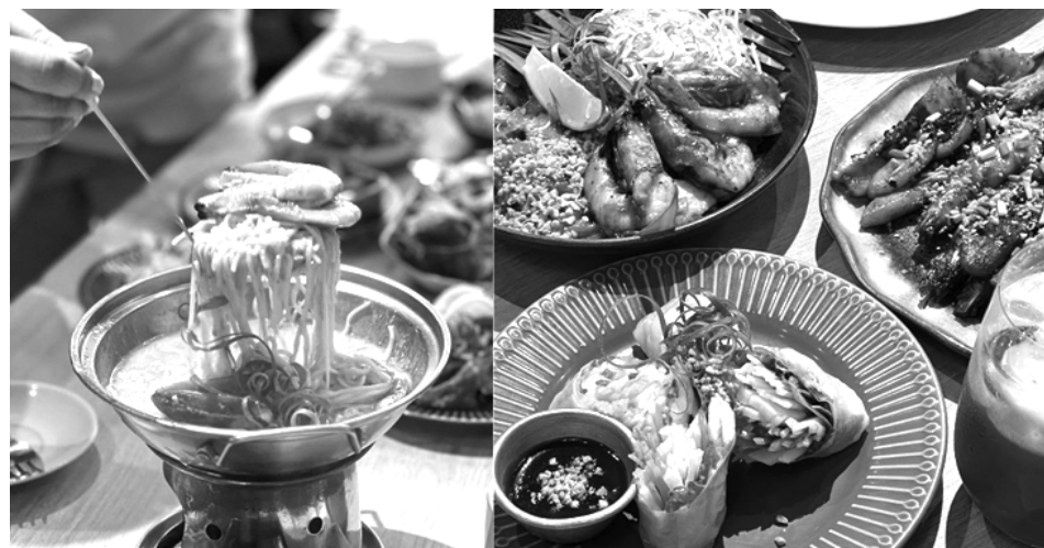
Fresh seafood and flavors of Southeast Asia converge right here at Crustasia.

South Luzon is a treasure trove of mouthwatering dishes, irresistible desserts, and unique delicacies. Keep savoring the flavors of the Philippines—and beyond—with this guide to the best dining spots at SM Supermalls in South Luzon.