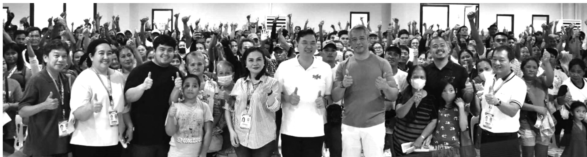
The Provincial Government of Cavite under the leadership of Governor Jonvic C. Remulla extended financial assistance to fire victims from the City of Bacoar in a cash distribution ceremony held at Revilla Hall, Bacoar Government Center on September 11, 2024.

A total of 398 beneficiaries received ₱5,000 each, aimed at providing relief to families affected by the fire incident. The assistance reflects the provincial government's commitment to helping Caviteños recover from unforeseen disasters and rebuild their lives. The city government of Bacoar led by Mayor Strike Revilla, in coordination with provincial officials, facilitated the smooth distribution of the aid to the affected residents. Local officials and beneficiaries expressed their gratitude for the timely support, which will aid them in addressing immediate needs during this challenging time.