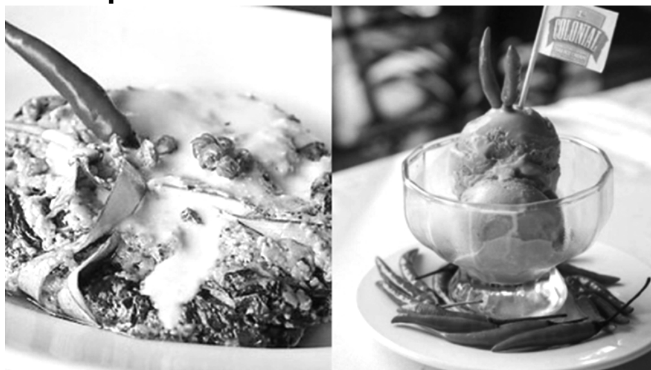
Creamy and spicy is what the Bicol region is known for—and 1st Colonial takes it up a notch with their Pinangat and Sili Ice Cream.