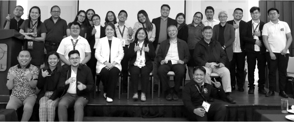
Group photo of the participants during the Regional Research, Development, and Innovation Committee – X

CAGAYAN DE ORO CITY – The Regional Research, Development, and Innovation – X (RRDIC – X), a special committee of the Regional Development Council – X (RDC – X) with fifty (52) members, recently conducted their 3rd Quarter Executive Committee Meeting on September 02, 2024, at N Hotel.