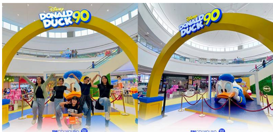
These squad enjoying Donuld Ducks' giant figure at SM City Molino

The celebration continues from SM City Molino to SM City Bacoar! Join the grand celebration of Donald Duck's 90th birthday this weekend at SM City Bacoar's Event Center. Fans of all ages are invited to commemorate the beloved Disney character by taking snaps at this giant photo spot until September 22 only. Don't miss out on Donald Duck and other collectibles, perfect for adding to your Disney collection. Bring your family and friends to share in the joy and celebrate this milestone in style! See you at SM City Bacoar this weekend!