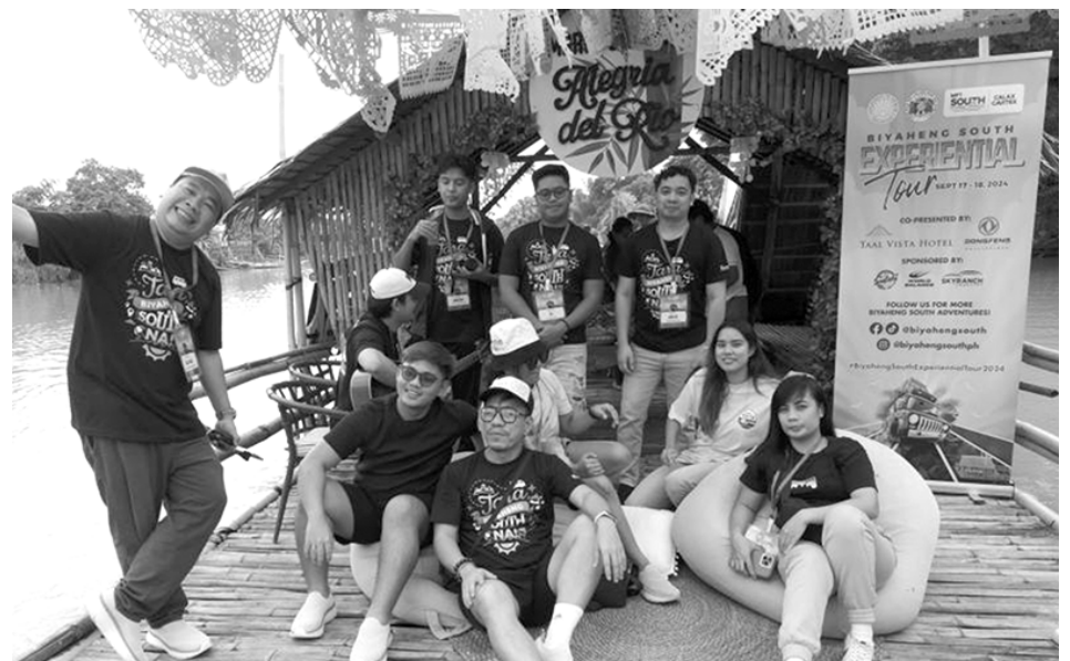
Biyaheng South Experiential Tour 2024 sails at Maragondon River

MPT South is a subsidiary of Metro Pacific Tollways Corporation (MPTC), the infrastructure arm of Metro Pacific Investments Corporation (MPIC). Aside from the CALAX and CAVITEX networks of toll roads, MPTC's domestic portfolio includes concessions for the North Luzon Expressway (NLEX), the NLEX Connector Road, the Subic-Clark-Tarlac Expressway (SCTEX), and the Cebu-Cordova Link Expressway (CCLEX) in Cebu.