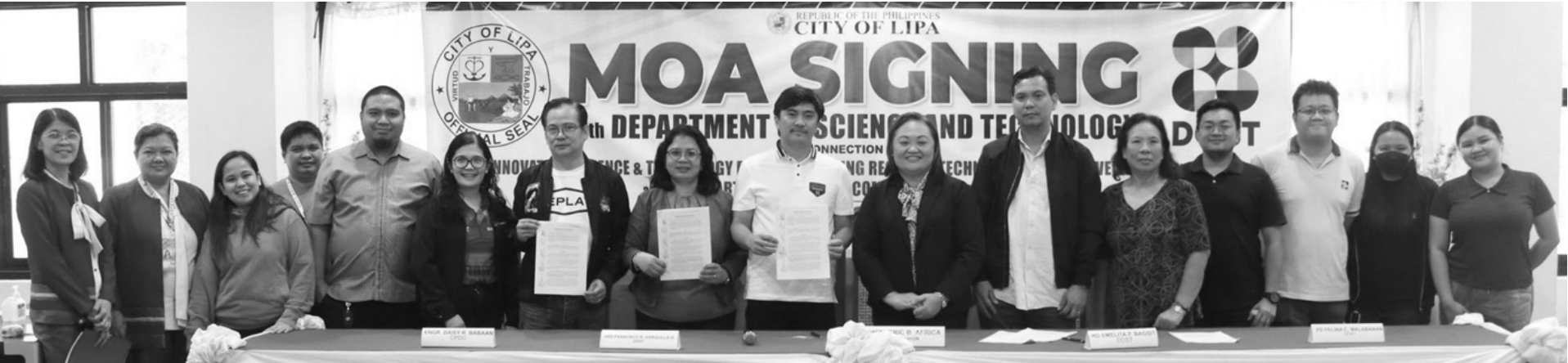
DOST-CALABARZON and the City Government of Lipa officially signed a Memorandum of Agreement (MOA) for the implementation of the Innovation, Science, and Technology for Accelerating Regional Technology-Based Development (iSTART) and Smart and Sustainable Communities (SSC) Programs at the Mayor's Office, Lipa City Hall.