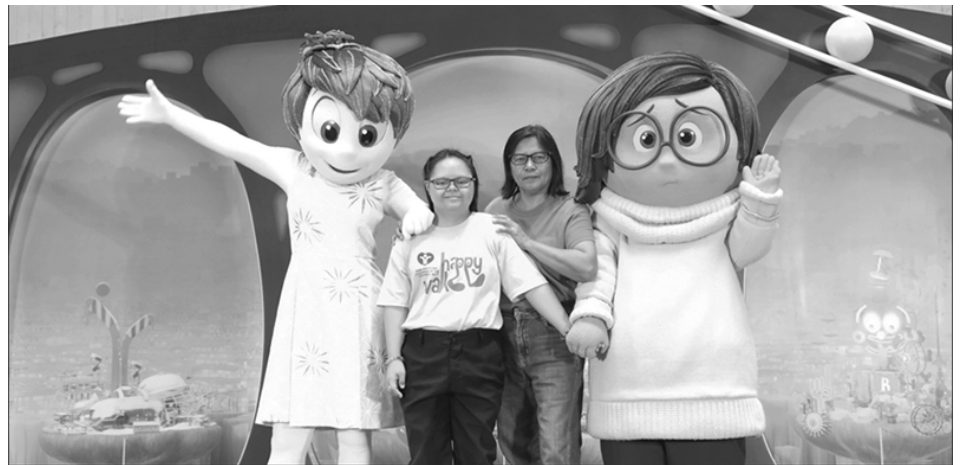
A special fan has the chance to meet their favorite characters from "Inside Out 2" at SM City North EDSA.

i s www.smsupermalls.com and follow SM Supermalls on social media for updates.