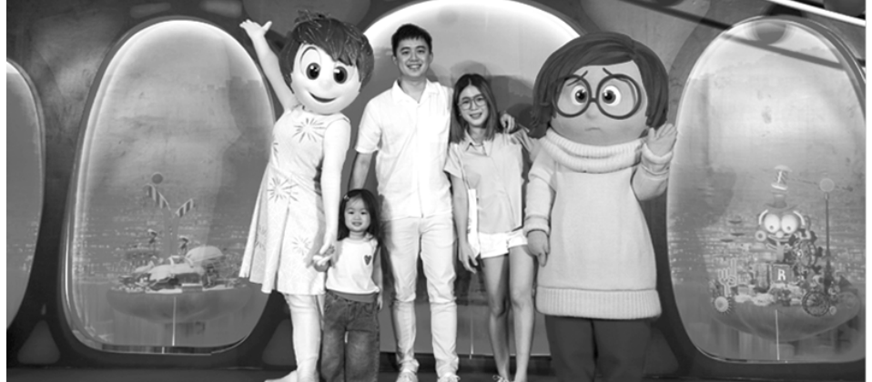
Joy fills the air as families experience a meet-and-greet with "Inside Out 2" characters at SM Seaside City Cebu.