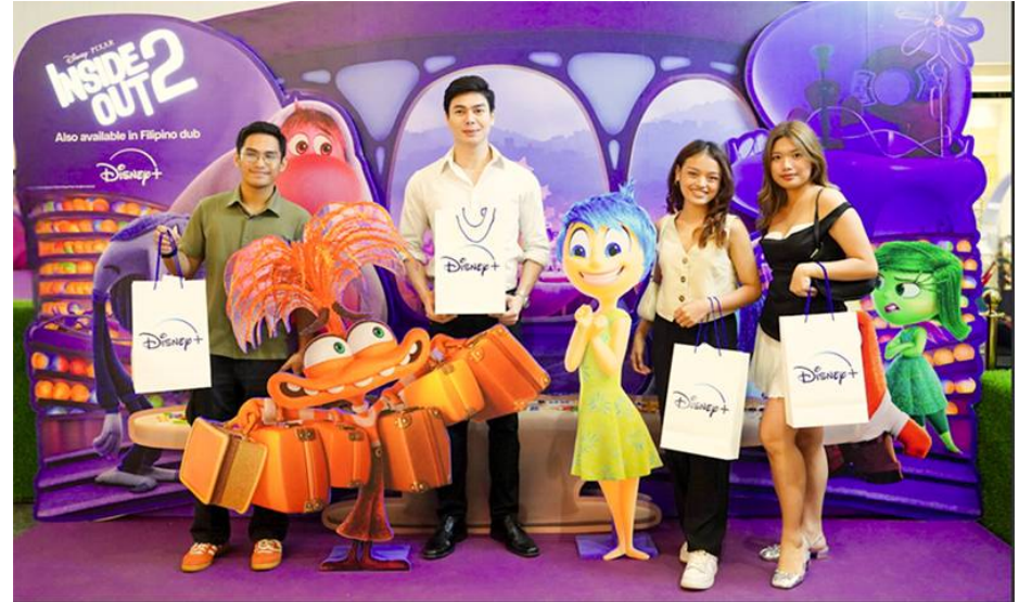
Cebuanos attend the "Inside Out 2" activation at SM Seaside City Cebu.

Fans of the beloved Disney and Pixar film "Inside Out 2" had the opportunity to create lasting memories with their favorite characters at SM Supermalls. Joy and Sadness, the iconic duo from the film's original five-personified emotions (the others being Anger, Fear, and Disgust), made special appearances at SM Seaside City Cebu on October 3, SM City North EDSA on October 5, and SM City Dasmarinas on October 6.