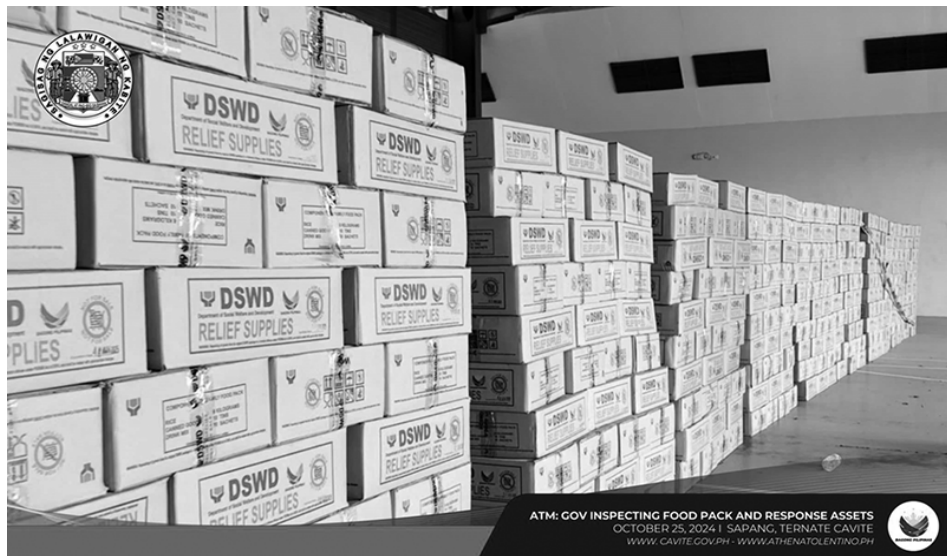
ATM: GOV INSPECTING FOOD PACK AND RESPONSE ASSETS OCTOBER 25, 2024 | SAPANG, TERNATE CAVITE WWW.CAVITE.GOV.PH - WWW.ATHENATOLENTINO.PH

Trece Martires City – Early Friday, October 25, as the weather slowly improves, Cavite Governor Athena Bryana Tolentino inspects the emergency response logistics of the provincial government and the stock pile of emergency food packs ready for hauling and distribution to the families heavily affected by severe tropical storm Kristine that hit the entire Luzon, leaving families displaced in Cavite.