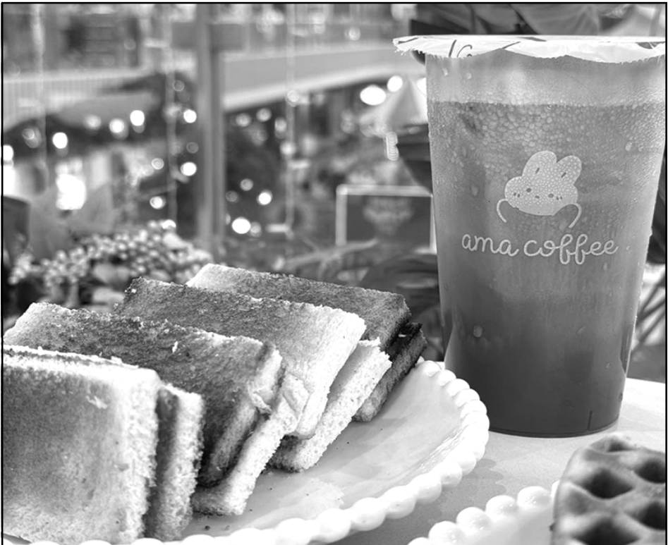
Welcome to ama coffee at SM City Tanza! Experience the rich flavors of traditional oriental coffee with a modern twist, all in a cozy and inviting space. Indulge in AMA Blue Latte, AMA Signature Coffee, and refreshing Korean Ade-Peach Flavor. Don't miss delicious desserts-Kaya Crackers, Kaya Butter Toast, and Waffles!