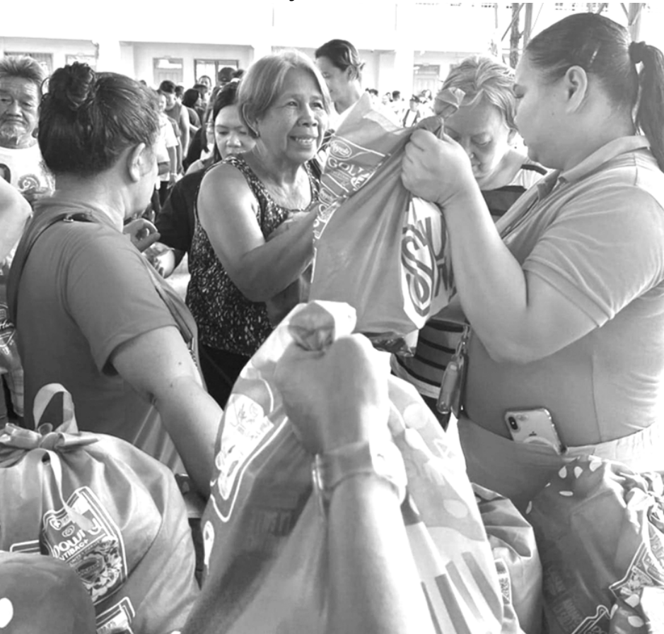
An elderly resident from Noveleta, Cavite, happily receives a Kalinga pack.