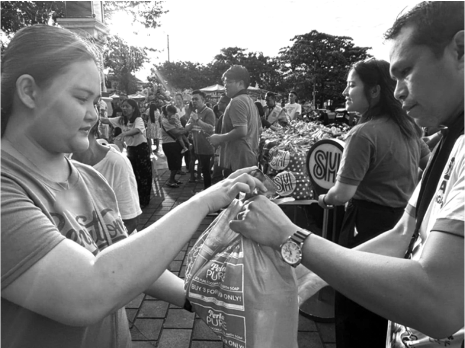
A Kalinga pack is being handed by an SM City Rosario employee to a woman residing in Cavite City.