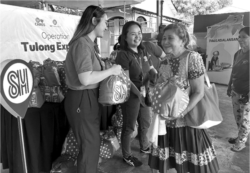
Nanay from Rosario, Cavite, takes home not just the Kalinga pack, but also the hope and joy that Operation Tulong Express initiative brings to her community.