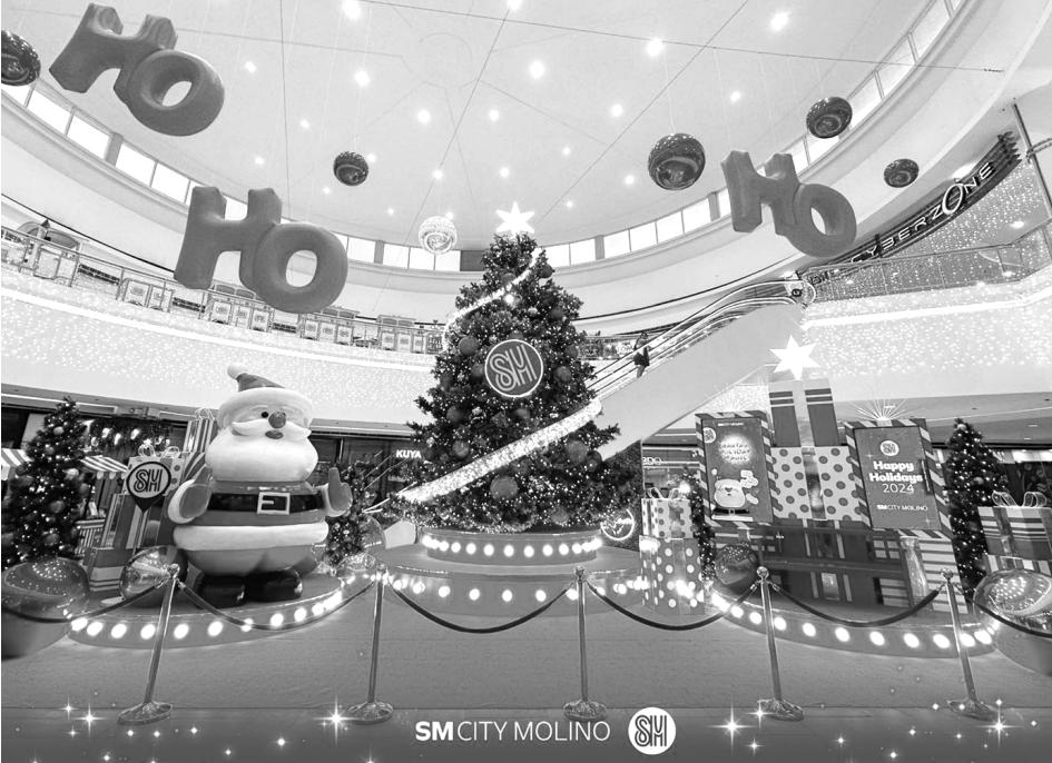
Santa's Holiday Magic at SM City Molino: The magic of Christmas has officially arrived at SM City Molino as Santa's Holiday Magic beautifully lits at the mall's Event Center, bringing more festivity with its 25ft tall Christmas tree and Giant Santa. This year, children from the Malipay Community joined in the celebration and shared in the spirit of giving as they cheerfully received their Bears of Joy. The event was made even more special with happy and festive performances by the Raz Singing Cherubim.