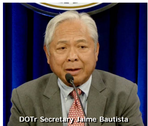
DOTr Secretary Jaime Bautista