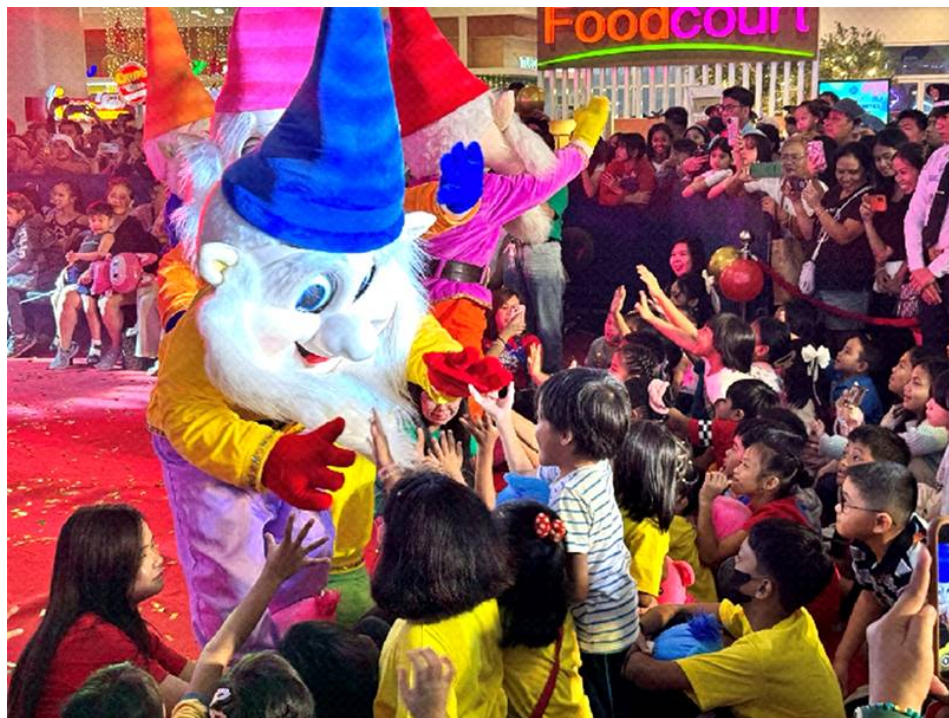
Kids were excited as they get to meet these magical characters during the Grand Magical Christmas Parade.