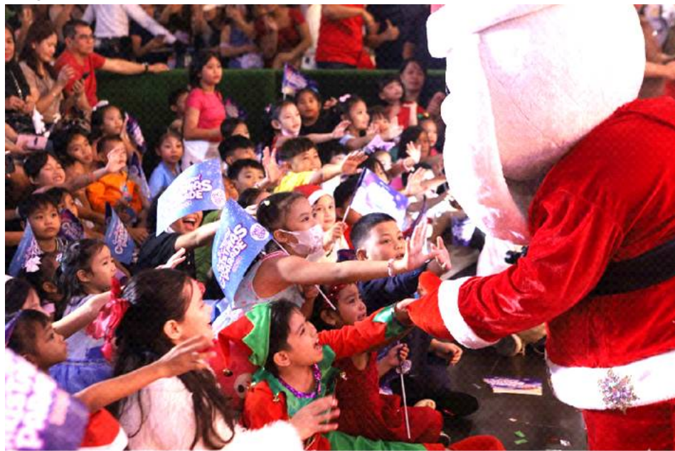
The excitement is palpable as young and old alike gather to catch a glimpse of Santa and his cheerful companions, each ready to create and capture lasting memories at SM City Bacoor.

for a celebration that's sure to be unforgettable! The Grand Magical Christmas Parade is more than just an event; it's a joyful experience filled with magic, laughter, and the warmth of holiday togetherness. Don't miss out on this magical holiday celebration—it's Christmas, the SM Supermalls way!