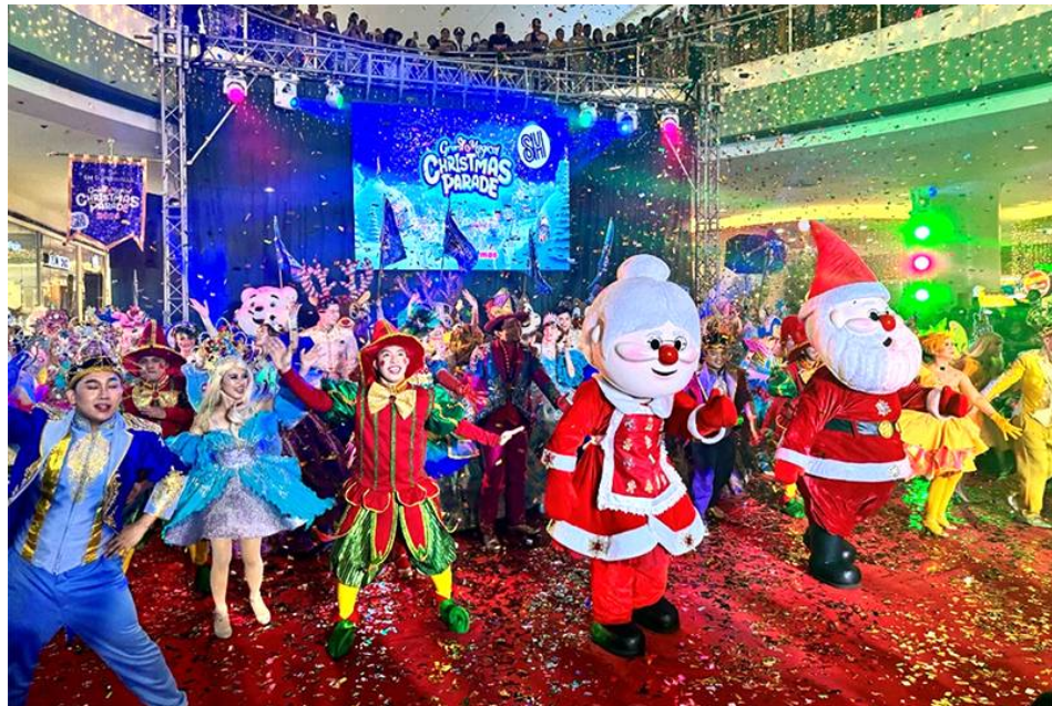
The Grand Magical Christmas Parade concluded with a festive dance featuring all the characters.