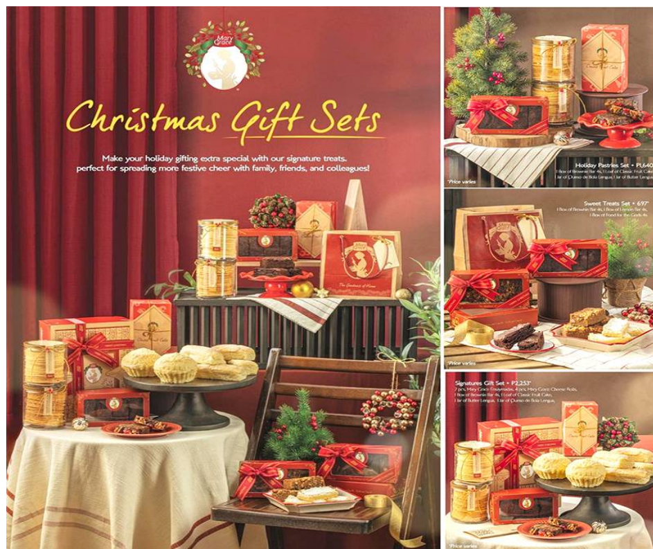
Sweeten up the holiday season and experience the joy of giving with a dash of Christmas magic found in our thoughtfully curated gift sets! Let's spread love, kindness, and cheer during this most special time of the year. Visit Mary Grace at SM City Molino and check out these signature gift sets for your loved ones this season.