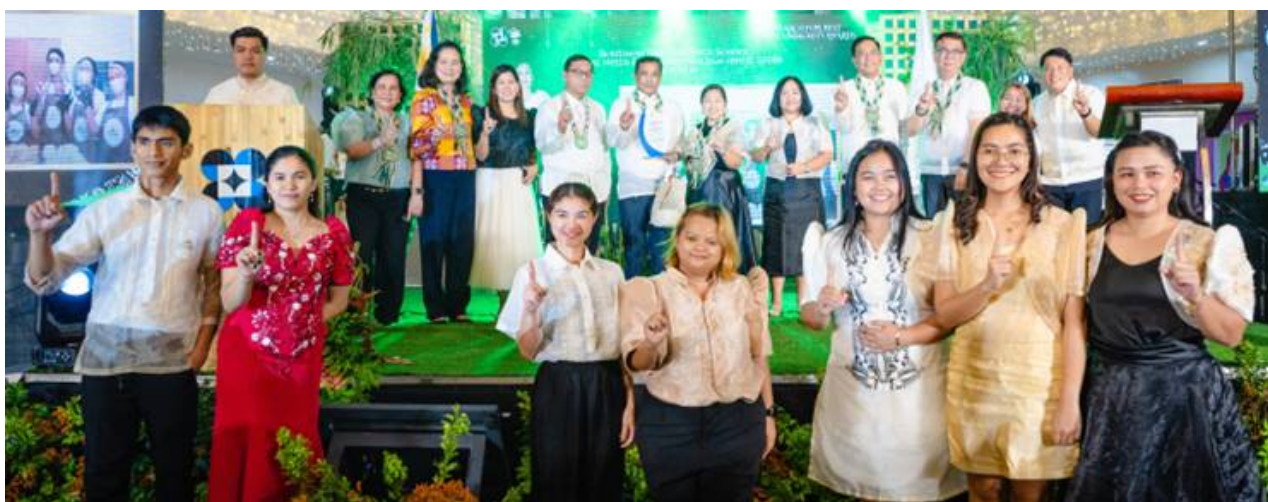
BNHS-SPED receiving the Most Inspiring CEST Community Award at the 2024 Search for Best CEST Community Awards during the 2024 National Science, Technology, and Innovation Week.