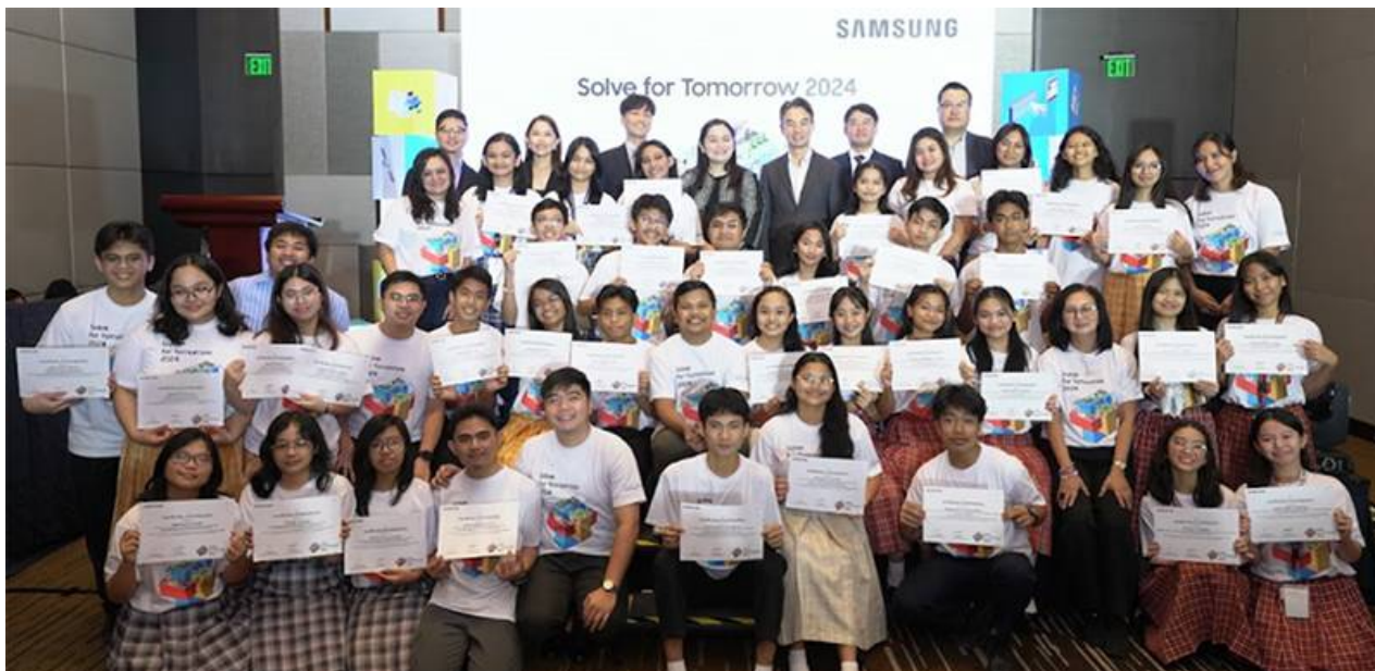
Almost 1,000 STEM students from public science high schools took on the challenge to propose solutions to local community challenges using technology and AI

The other seven teams to make it to the finals and will receive Php 15,000 for their team and Php 5,000 for their teacher include "PAROLA: Utilizing Rain and Floodwater to