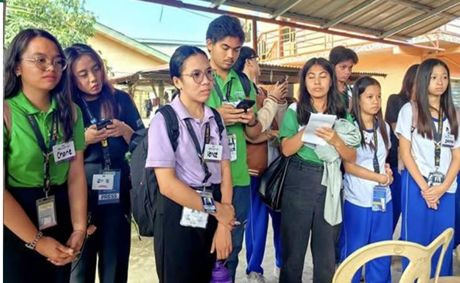
Look. Student journalists from Lipa City Colleges convened as the two-day Science Journo Ako went to Lipa City to enhance their skills in creating science content across multimedia platforms on 21-22 November 2024.