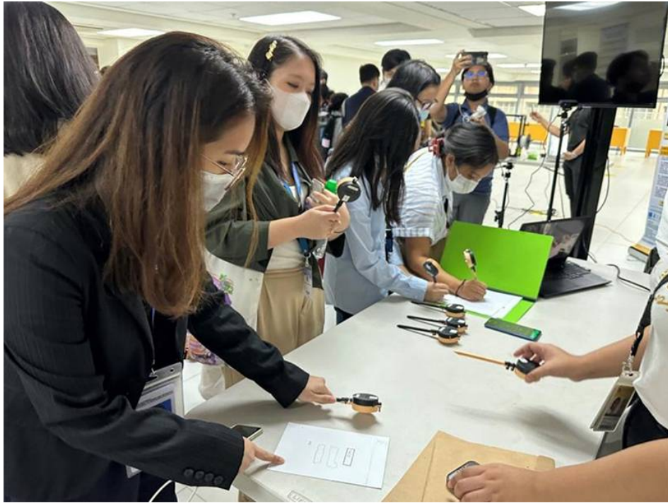
Look. Student journalists from Lipa City Colleges convened as the two-day Science Journo Ako went to Lipa City to enhance their skills in creating science content across multimedia platforms on 21-22 November 2024.

Local researchers have developed a handwriting assessment tool, are looking to get more partners to conduct more tests across the country.