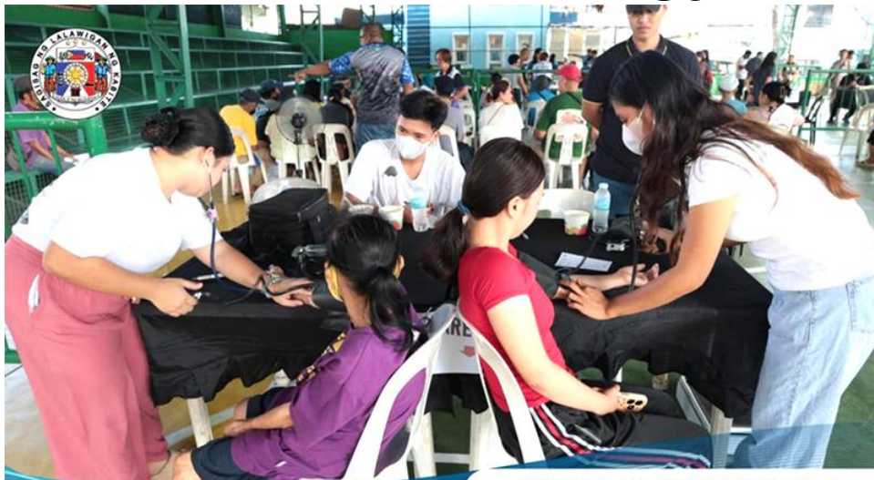
ATIN 'TO! AT YOUR SERVICE

PGCS MEDICAL AND DENTAL MISSION PROGRAM JANUARY 7, 2025 | BRGY. SAN MATEO, DASMARIÑAS CITY WWW.CAVITE.GOV.PH - WWW.ATHENATOLENTINO.PH