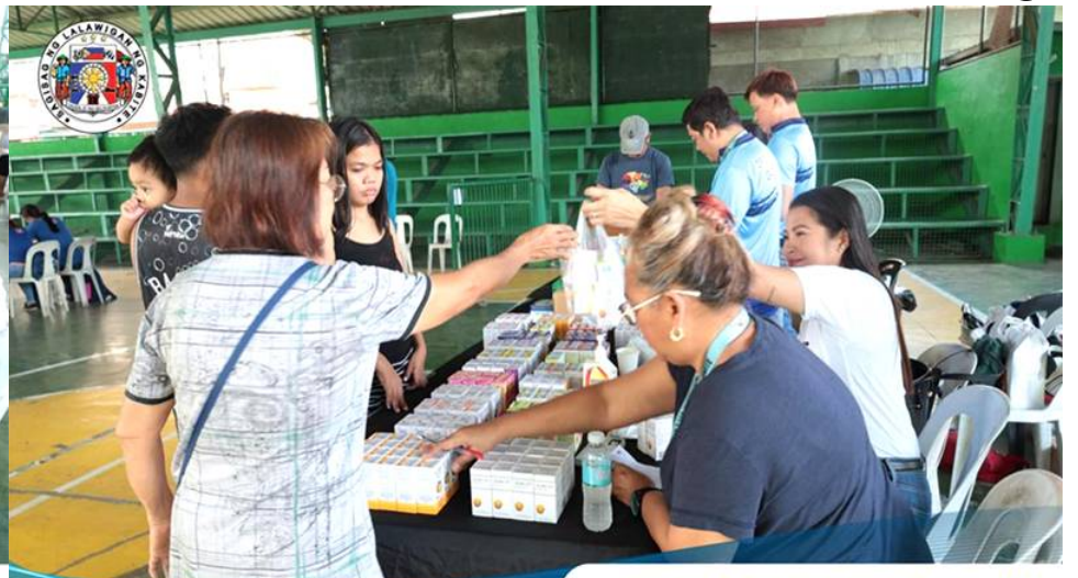
ATIN 'TO! AT YOUR SERVICE

PGCS MEDICAL AND DENTAL MISSION PROGRAM JANUARY 7, 2025 | BRGY. SAN MATEO, DASMARIÑAS CITY WWW.CAVITE.GOV.PH - WWW.ATHENATOLENTINO.PH