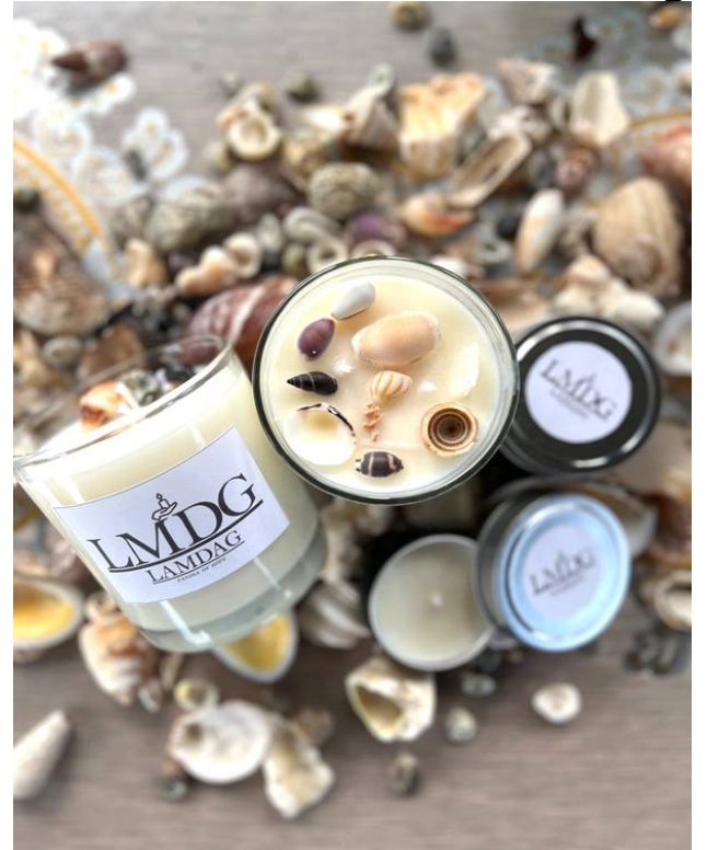
Beautifully handcrafted candles resulting from the DOST Camiguin and CAMI Candle PH's candle-making training program for children in conflict with the law. This initiative provides them with essential livelihood skills and a pathway toward hope and reintegration.

The Department of Science and Technology—Region 10 (DOST 10) envisions being an effective and competent