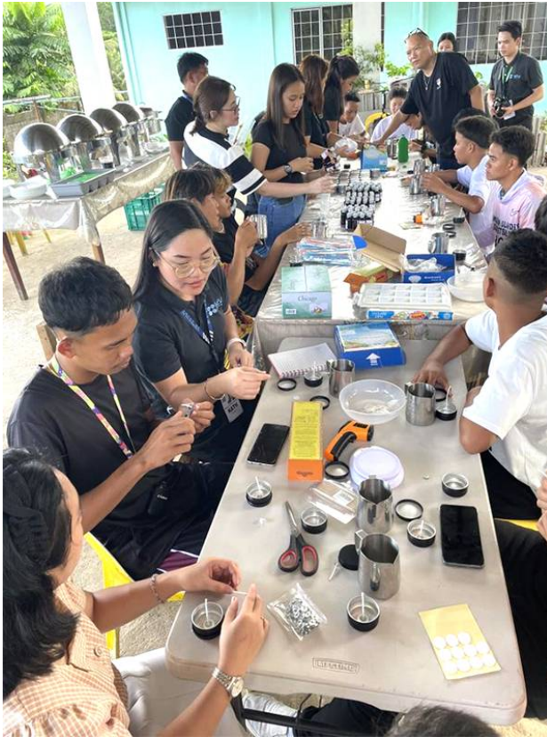
Participants actively engaged in candle-making, applying techniques learned during the demonstration to create the aromatherapy candles.

This candle-making initiative underscores DOST's commitment to fostering inclusive opportunities and building resilient communities through innovation and empowerment. By addressing community challenges with sustainable solutions, DOST showcases the power of skill-building programs to drive positive change and uplift lives. (NNCD,JKRB/DOST