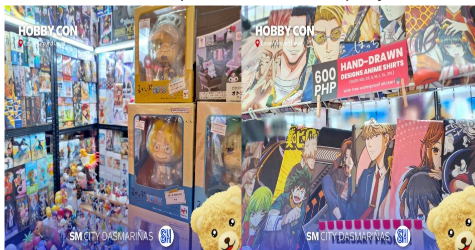
Anime lovers and collectors, this is your moment! Hobby Con is taking over SM City Dasmariñas with epic figures, fandom exhibits, and everything otaku-approved. Visit the Main Event Center for an ultimate hobby haven until February 23!