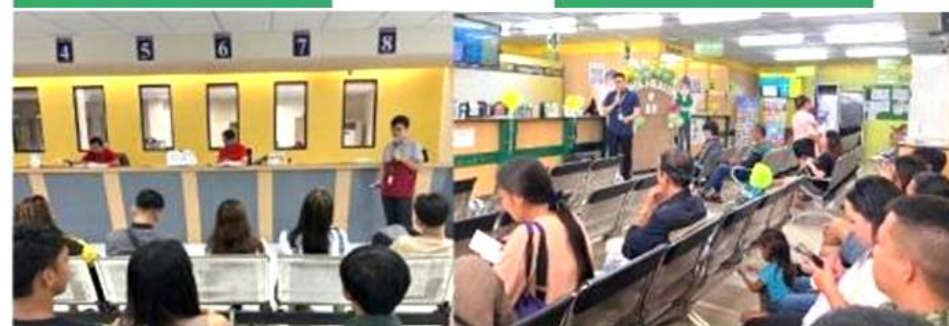
LHIO Lucena City