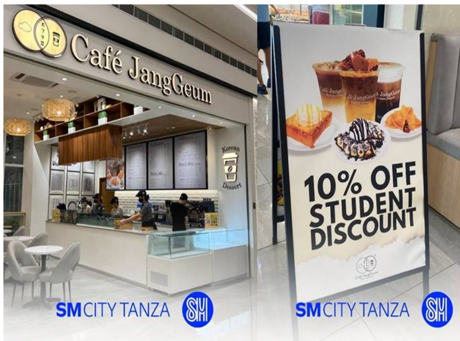
Café Jang Geum at SM City Tanza brings you authentic Korean desserts and snacks! Good news for students—enjoy 10% off when you present a valid student ID! Promo excludes promotional items and frequency card offers.