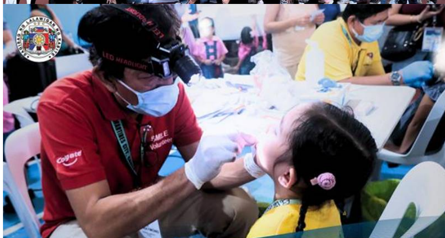
ATIN 'TO! AT YOUR SERVICE