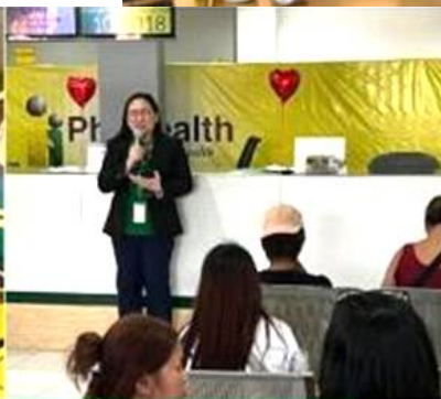
LHIO San Pablo City