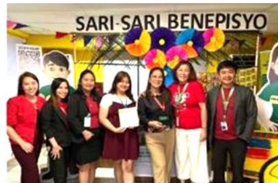
LHIO Calamba City