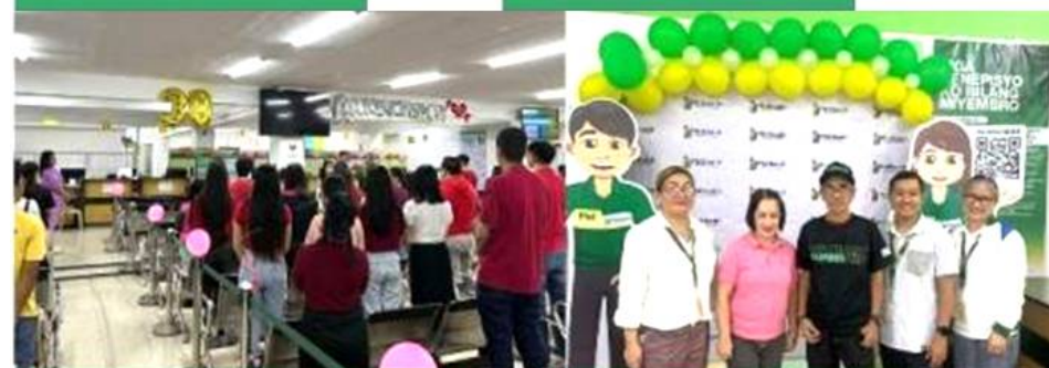
LHIO Trece Martires City