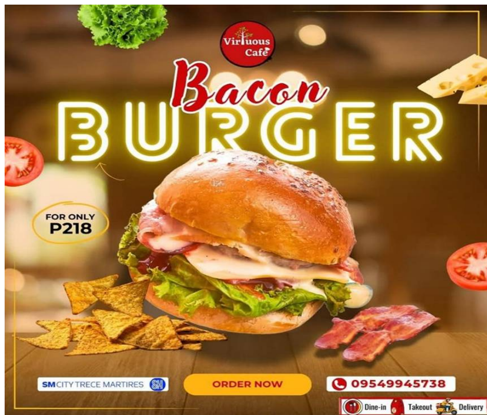
Nakakabusog at sulit na Burger ba ang hanap mo? Virtuous Cafe Bacon Burger na yan! Sa halagang P218 siguradong solve and cravings mo! Tara sa Virtuous Cafe, SM City Trece Martires