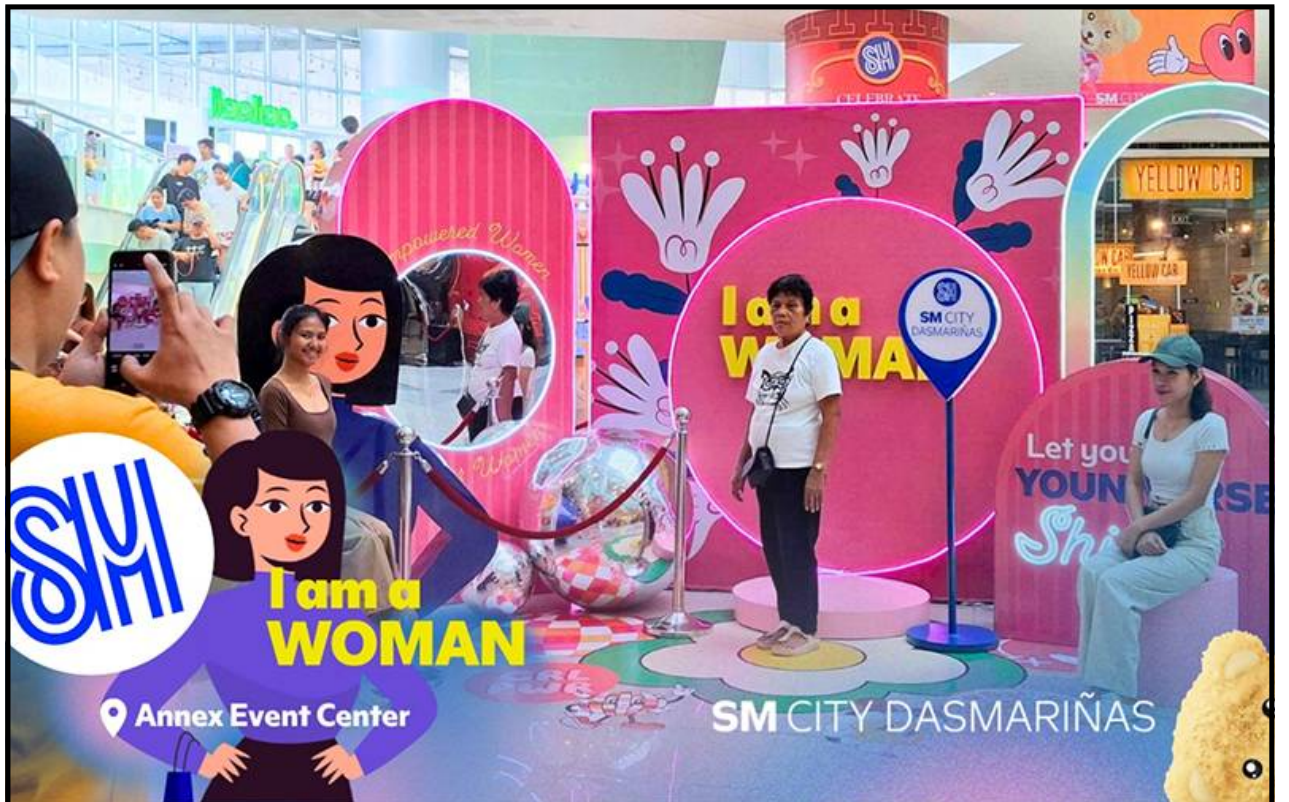
Celebrating Strength and Empowerment at SM City Dasmariñas! SM City Dasmariñas marks Women's Month with a tribute to the resilience, achievements, and contributions of women in the community. Through inspiring activities and meaningful celebrations, the mall honors the power of women and their impact on society.