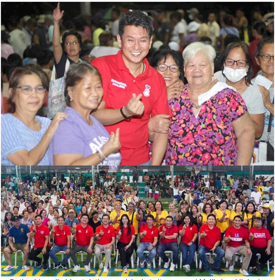
Dating bise-alkalde at dating municipal at city mayor si Maliksi na kilala rin sa initial niyang ELM o palayaw na Manny.

Bakit maraming Imuseño ang napupusuang maging kongresista nila si dating Imus City Mayor Maliksi na mahigit din palang dalawang dekada sa politika at may magandang naiwang akomplisment sa siyudad.