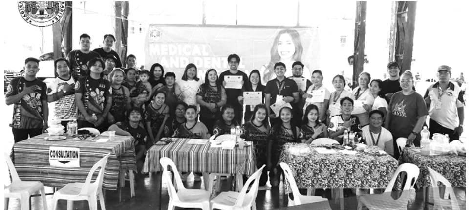
ATIN 'TO! AT YOUR SERVICE

PGCS MEDICAL AND DENTAL MISSION PROGRAM 10 APRIL 2025 | BRGY. SUNNYBROOKE II, GENERAL TRIAS CITY WWW.CAVITE.GOV.PH - WWW.ATHENATOLENTINO.PH