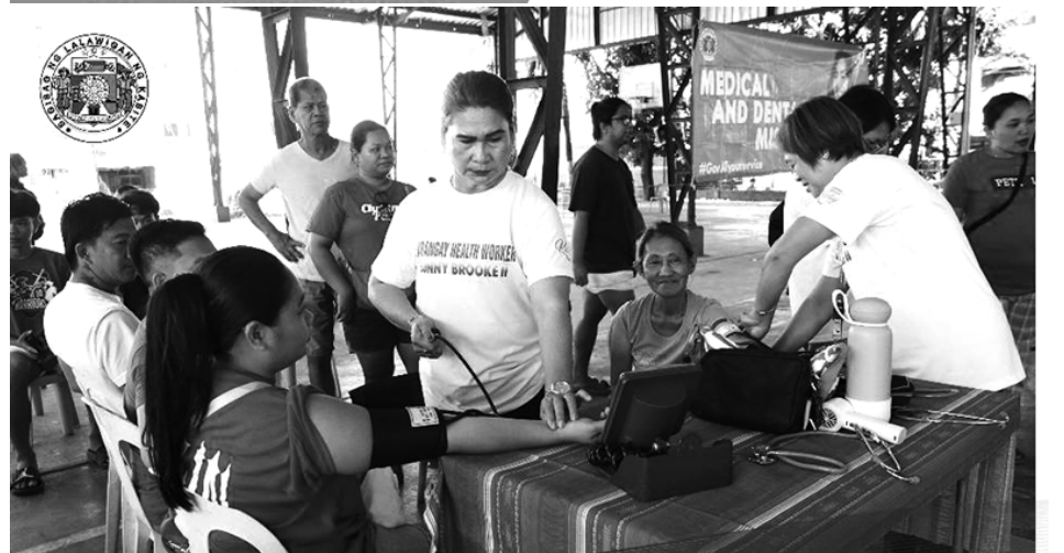
ATIN 'TO! AT YOUR SERVICE

PGCS MEDICAL AND DENTAL MISSION PROGRAM 10 APRIL 2025 | BRGY. SUNNYBROOKE II, GENERAL TRIAS CITY WWW.CAVITE.GOV.PH - WWW.ATHENATOLENTINO.PH