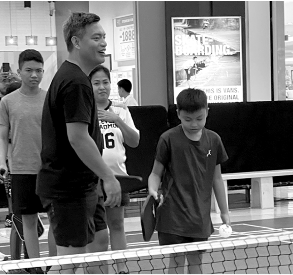
Pickleball is a sport for everyone—welcoming players of all ages and skill levels to join the game and have fun.