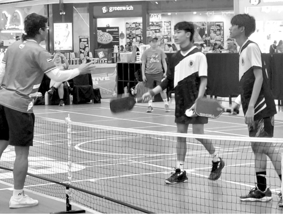
Pickleball can be played as singles (one-on-one) or doubles (with a partner), making it a versatile and engaging sport for all players.

perfect space to enjoy the game in a safe and welcoming environment. Get in the game and experience the Pickleball excitement at SM City Rosario!