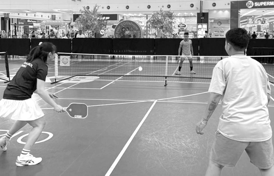
Experience a whole new level of excitement as you play Pickleball at SM Active Hub, SM City Rosario!