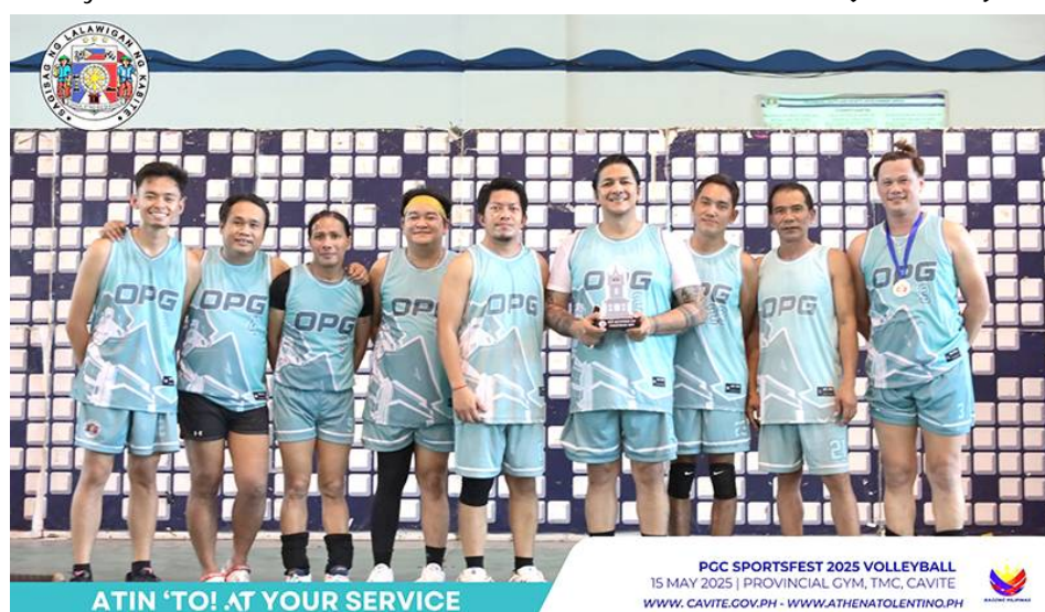
PGC SPORTSFEST 2025 VOLLEYBALL 15 MAY 2025 | PROVINCIAL GYM, TMC, CAVITE WWW.CAVITE.GOV.PH - WWW.ATHENATOLENTINO.PH

The two-day event is expected to gather scientists, researchers, policymakers, community