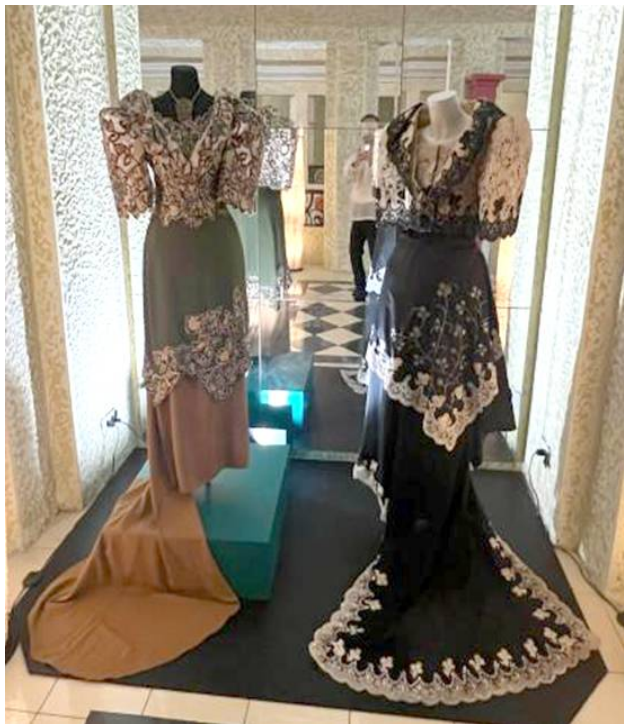
Some of the Ternos on display.