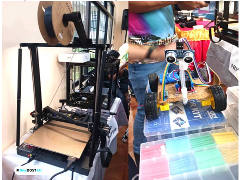
Learning Technologies including robotics tools and other interactive educational materials available in the 21st CLEM.

During the launch, DOST technical personnel, alongside science and mathematics teachers, showcased a range of advanced learning tools,