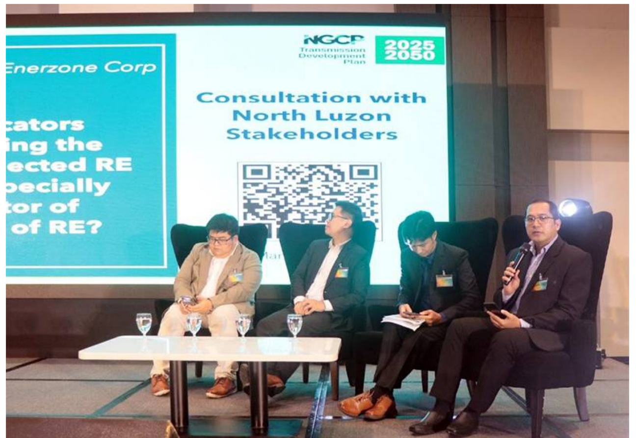
Open discussions with stakeholders were held to take into account suggestions and inputs from other sectors of the power industry.