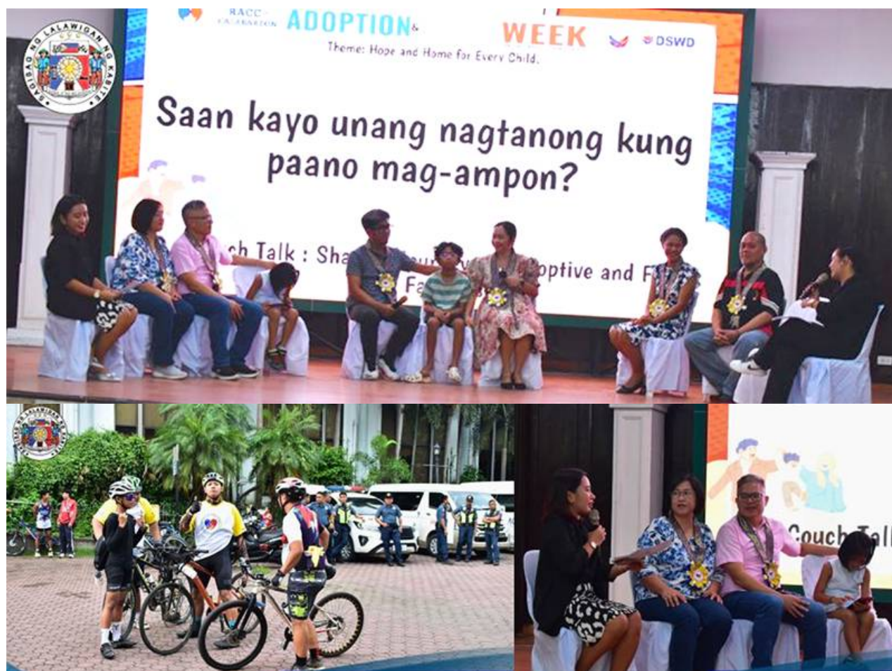
from the Provincial Social Welfare and Development

Capping off the day was the Ceremonial Turnover of the AACCW hosting