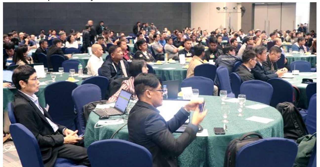
Public consultations were held in Luzon, Visayas, and Mindanao, as well as with key government agencies to align future grid developments.