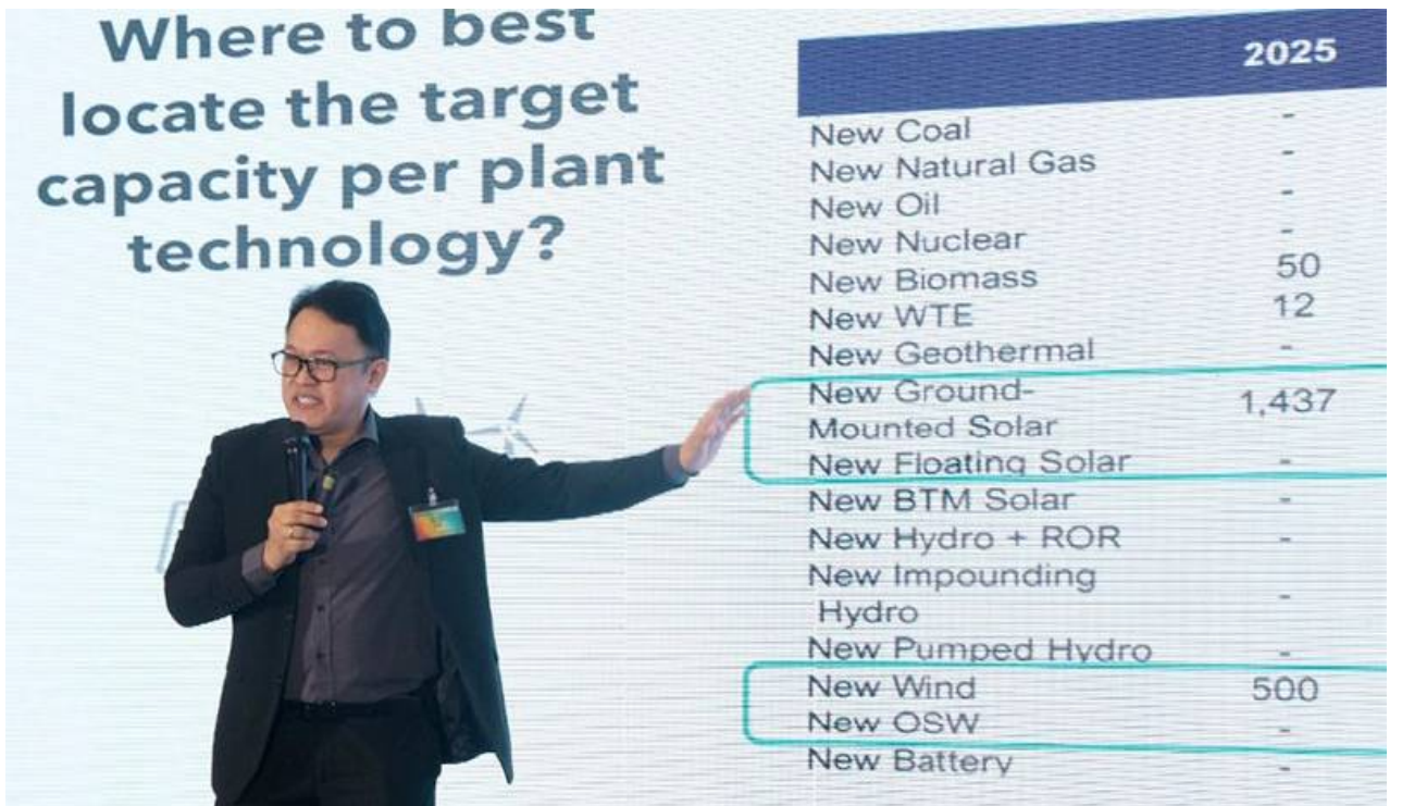
NGCP, led by the Transmission Planning Department, held public consultations for the Transmission Development Plan 2025-2050 as part of horizon planning for the Philippine grid.