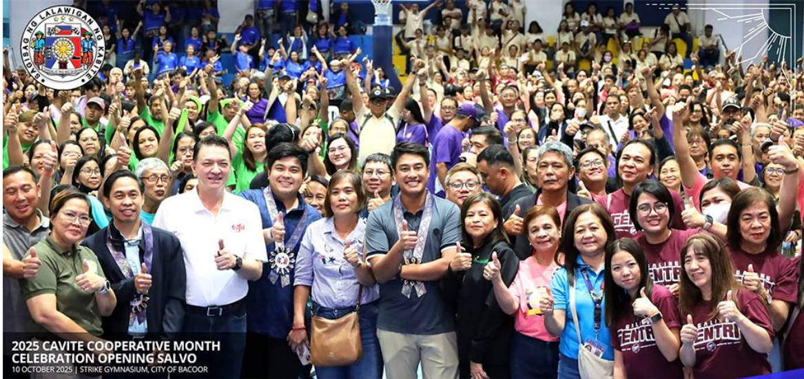
2025 CAVITE COOPERATIVE MONTH CELEBRATION OPENING SALVO 10 OCTOBER 2025 | STRIKE GYMNASIUM, CITY OF BACOR