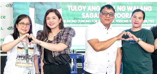
Residents and beneficiaries expressed gratitude for the assistance, noting how the financial aid will help cover school-related expenses such as supplies, uniforms, and transportation. The program also reinforces the city's commitment to good governance, transparency, and compassion.

Mayor Gemma Lubigan, the driving force behind Trece Martires' progressive social welfare agenda, emphasized the importance of education as a tool for empowerment. "Sa Bagong Trece, walang maiwan. We are committed to uplifting every family, especially our solo parents and PWDs, through meaningful and sustainable support," she said during the event. The initiative reflects the city's broader vision of inclusive governance and community development. By prioritizing educational access for marginalized sectors, Trece Martires continues to live up to its title as the "Lungsod ng Pag-Asa" — a city of hope.