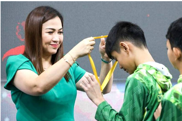
#SulongNaSulongPa Dasmariñas, the city reaffirmed its dedication to progress and excellence—not just in sports, but in all aspects of development. The awarding ceremony was not only a celebration of athletic achievement but also a testament to the power of vision, support, and unity.