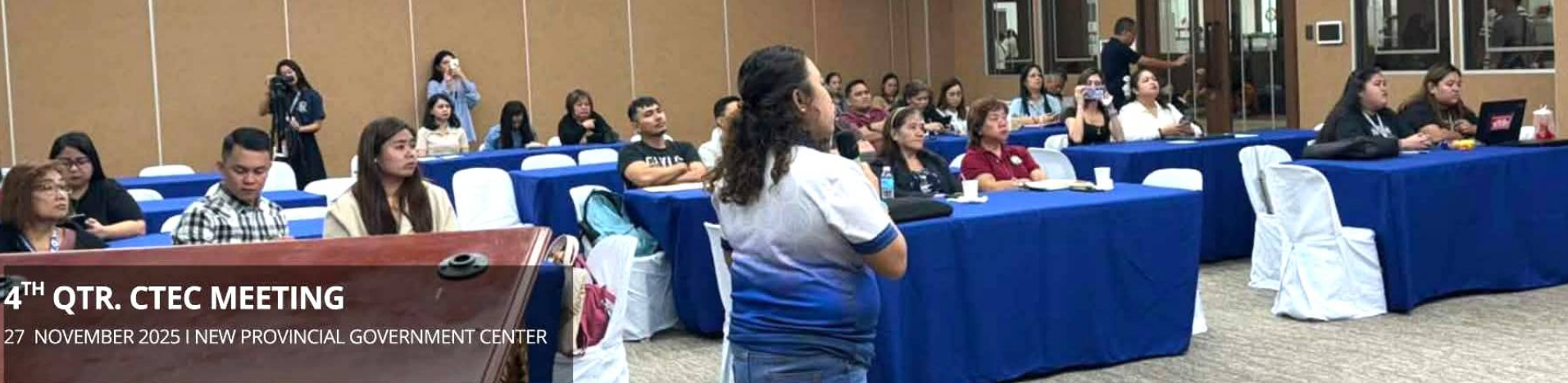
4 TH QTR. CTEC MEETING

27 NOVEMBER 2025 | NEW PROVINCIAL GOVERNMENT CENTER