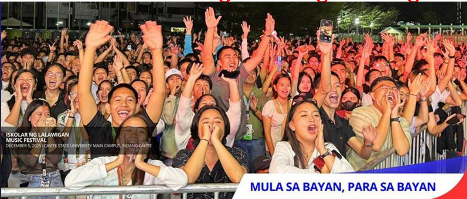
ISKOLAR NG LALAWIGAN MUSIC FESTIVAL DECEMBER 5, 2025 | CAVITE STATE UNIVERSITY MAIN CAMPUS, INDANG CAVITE