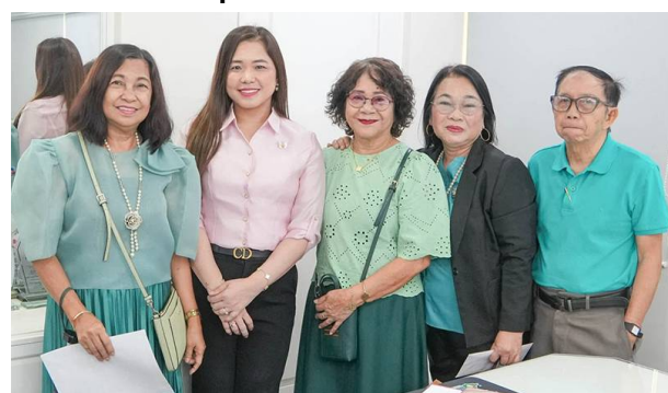
Mayor Gemma Lubigan personally presided over the ceremony, recognizing the invaluable contributions of retired teachers who dedicated their lives to molding generations of Treceños. ► MAYOR GEMMA • 7

Trece Martires City – On February 16, 2026, the Retired Teachers Association formally held its oath-taking ceremony at the Office of the City Mayor, marking a significant step in strengthening collaboration between the local government and retired educators in advancing education and public service.