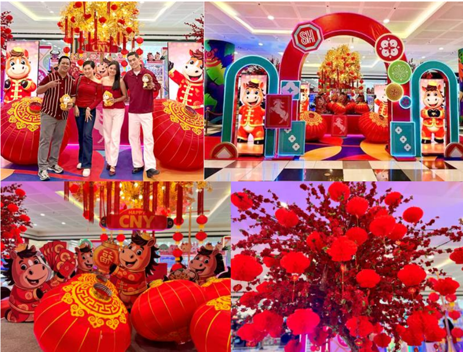
Lucky vibes are in full swing at SM City Trece Martires: Our Chinese New Year centerpiece is bringing all the festive energy, vibrant reds, dazzling details, and the perfect photo spot to welcome prosperity and good fortune. Celebrate with the fam, make your wishes, and enjoy a MAX OUT Chinese New Year experience filled with joy, abundance, and fresh beginnings. Gong Xi Fa Cai, SM Fam!