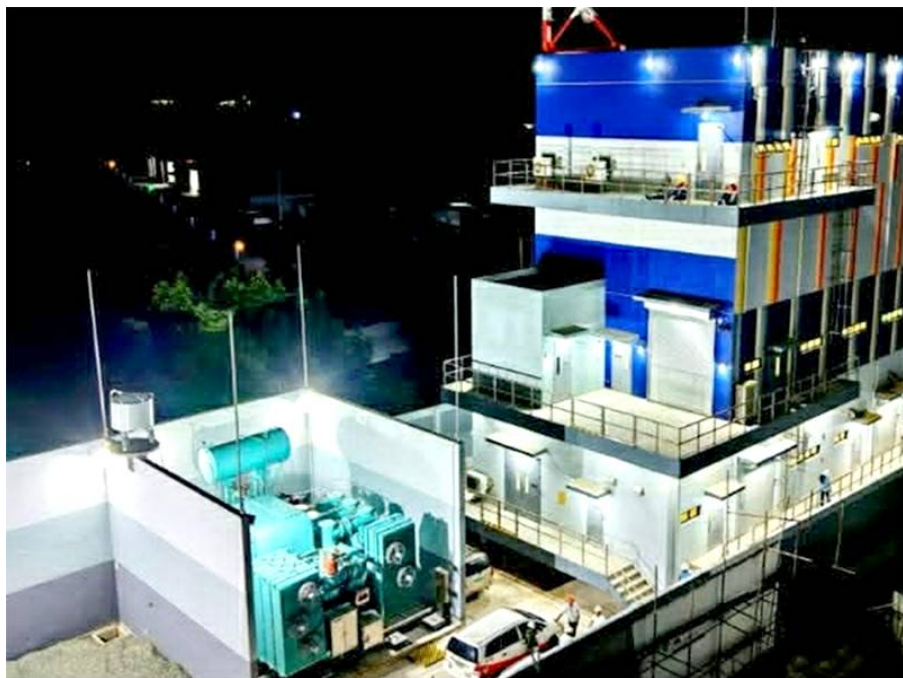
Inaasahang magiging mas maayos at mas maaasahan ang serbisyo ng kuryente sa ilang bahagi ng Cavite matapos pormal na i-energize ng Manila Electric Company (Meralco) ang bagong Island Cove Gas Insulated Switchgear (GIS) Substation. ▶ MERALCO • 5