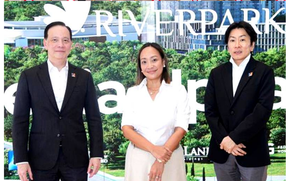
GENERAL TRIAS, CAVITE – Federal Land NRE Global Inc. (FNG), together with Fast Retailing Philippines, Inc. (FRPH), marked the opening of the UNIQLO Logistics Facility at Riverpark North, underscoring a key milestone for both companies and reinforcing Cavite's role in regional logistics and investment activity. ▶ UNIQLO • 5