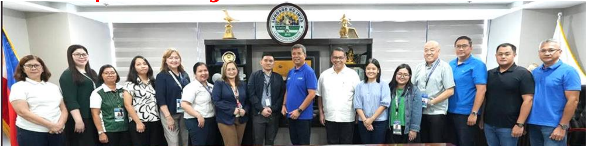
Imus City, Cavite — The City Government of Imus successfully conducted its Commission on Audit (COA) Exit Conference for fiscal year 2025, underscoring its commitment to transparency, accountability, and effective governance. ▶ CITY OF IMUS • 5