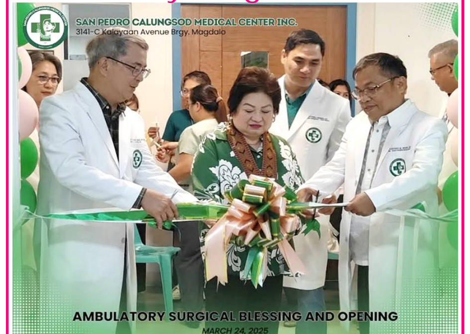
AMBULATORY SURGICAL BLESSING AND OPENING MARCH 24, 2025

Kawit, Cavite – San Pedro Calungsod Medical Center (SPCMC) proudly marked another milestone in healthcare delivery with the official blessing and opening of its Ambulatory Surgical Services, a facility designed to bring high-quality outpatient surgical care closer to Caviteños.