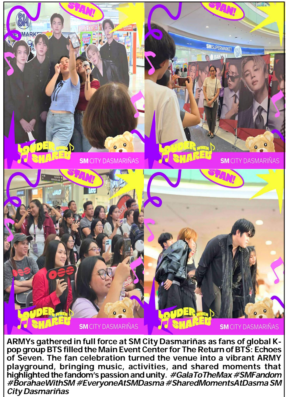
ARMYs gathered in full force at SM City Dasmariñas as fans of global K-pop group BTS filled the Main Event Center for The Return of BTS: Echoes of Seven. The fan celebration turned the venue into a vibrant ARMY playground, bringing music, activities, and shared moments that highlighted the fandom's passion and unity. #GalaToTheMax #SMFandom #BorahaeWithSM #EveryoneAtSMDasma #SharedMomentsAtDasma SM City Dasmariñas

peak hours. In NLEX, anticipate heavy northbound traffic from Wednesday afternoon to Thursday afternoon and increased southbound volume during the afternoon and evening hours on Saturday and Sunday. Expect heavy southbound traffic on early Monday morning. Motorists are also advised to check their RFID account to ensure sufficient balance, inspect their vehicles before traveling, stay well-rested, and follow speed limits and traffic regulations. Updates are available via the official social media pages as well as the MPT DriveHub app, to keep motorists informed on the latest situation on the MPTC expressways.