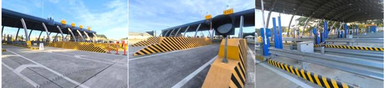
connected, progressive, and resilient Cavite. The CALAX expansion stands as a testament to the power of partnership and future for the province and its people.